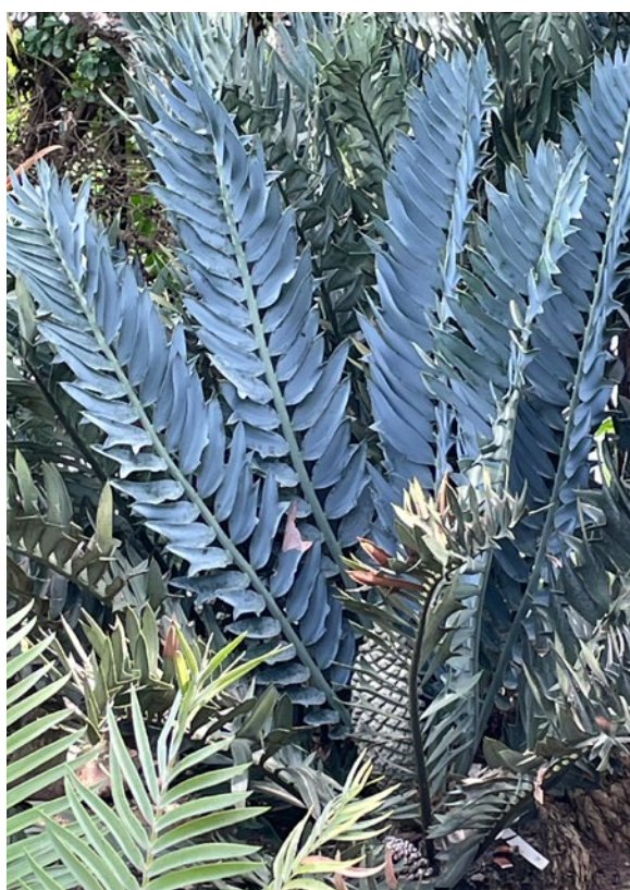
Figure 3. The so-called "True Blue" E. arenarius .