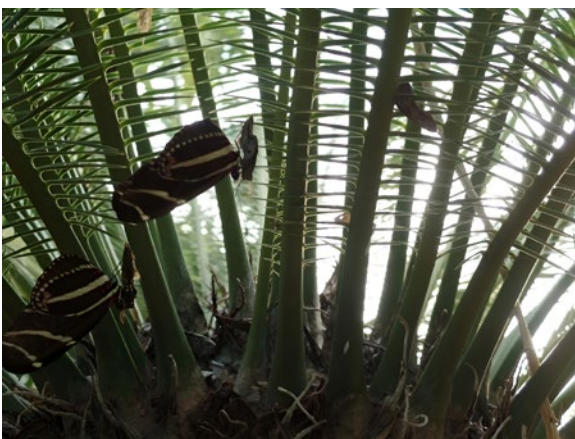
Figure 4. Heliconia hatchlings in a D. angustifolium .

The overarching ambition of curating in my garden is to create and maintain an interdependent multi-species system with a foundation of palms and cycads. For example, I began to create the following butterfly habitat about twenty years ago (it took several years to establish, and takes a year or so to re-establish after each hurricane). In order to attract butterflies to my garden (particularly Heliconius charithonia , but also Dione vanillae , commonly called Zebra longwings and Gulf