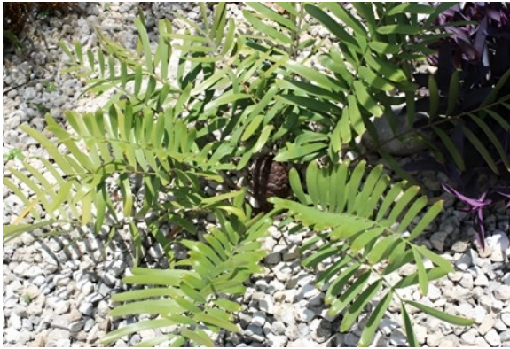
Figure 8. Female Z. lucayana recently pollinated by Z. lucayana at right (Figure 9).