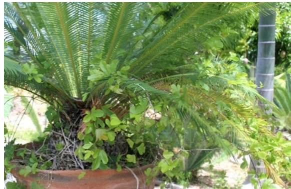
Figure 3. D. angustifolium , scaffold plant for P. suberosa .

fritillaries, respectively), I planted food plants for both the larvae and the parents. These include one species of passiflora ( Passiflora suberosa ) and three species of Hamelia ( patens , patens var. glabra , and cuprea ). Also, while the palms ( Chrysalidocarpus pambana , various Coccothrinax , etc.) serve as the overstory to dapple the sunlight, several species