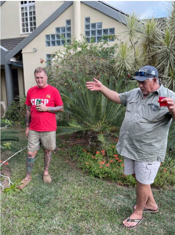
Figure 7. We're talking "big ones".

We started with his monstrous E. laurentianus with leaves that seemed to go on for ever, and after many hours, finished at his dwarf E. poggei . His collection consists of African, Asian, Australian and New World species, including Cycas bifida , Zamia vasquezii , Zamia manicata , Zamia furfuracea and some Ceratozamia species. The discussions were mainly about local species and included the forms of E. longifolius , E. natalensis with the Railway, Jolivet, Kranskop, High Flats, Vryheid and Port Edward forms, as well as a green E. horridus and a very thorny E. princeps .