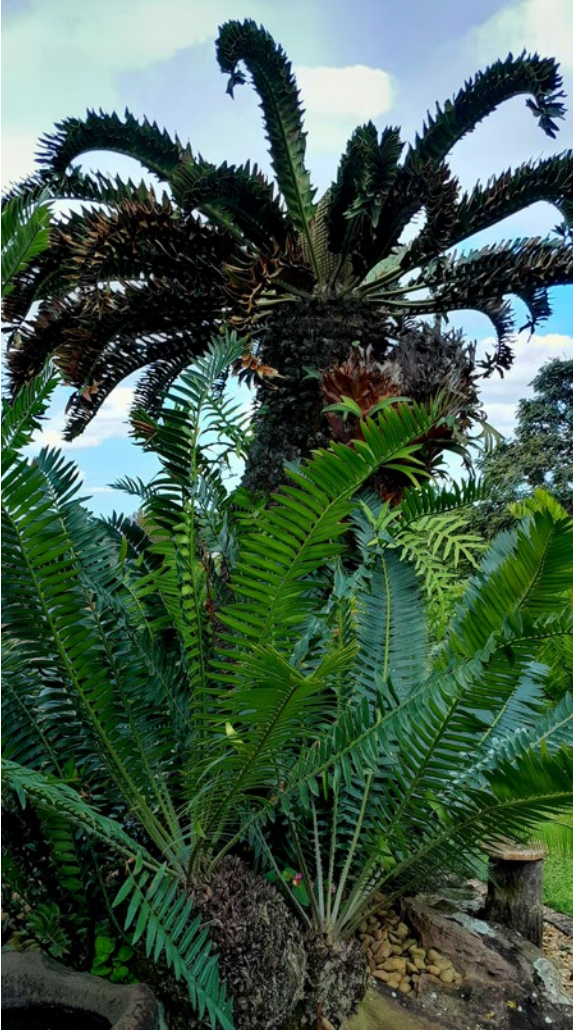
Figure 28. A large E. latifrons , also in Peter's garden.

Kingston Place Guest House and recommend it to everyone. It is always good after a tour to reflect on what you have seen and learned: