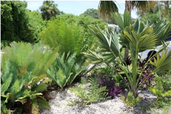
Figure 17: (L to R) Group of Encephalartos sp.; at center Z. lucayana and at right front Sabal palmetto 'Lisa'.