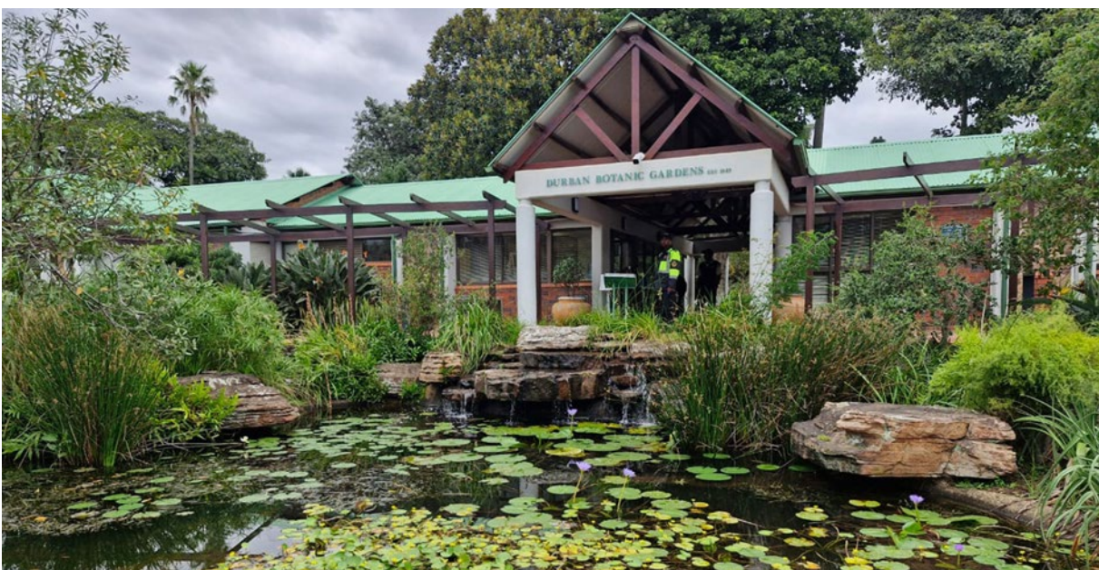
Figure 20. The entrance to the Durban Botanic Gardens.