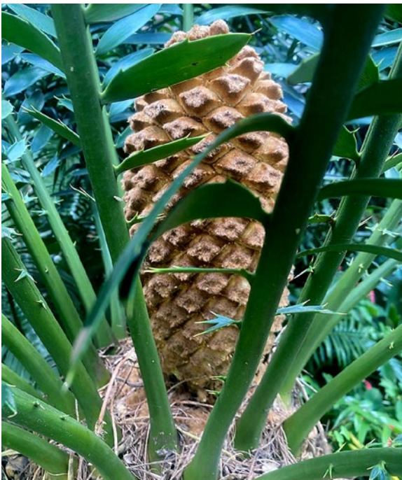
Figure 2. E. aemulans - male cone.