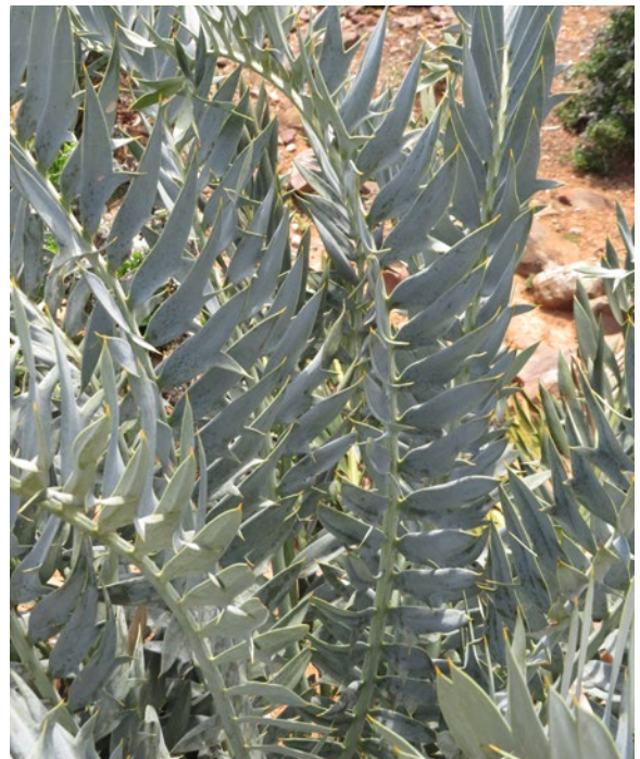
Figure 2. Leaf detail of the plant above reminds one of E. trispinosus or perhaps E. horridus ? The current DNA study will shed light on what this is and how it relates to other populations close to it.