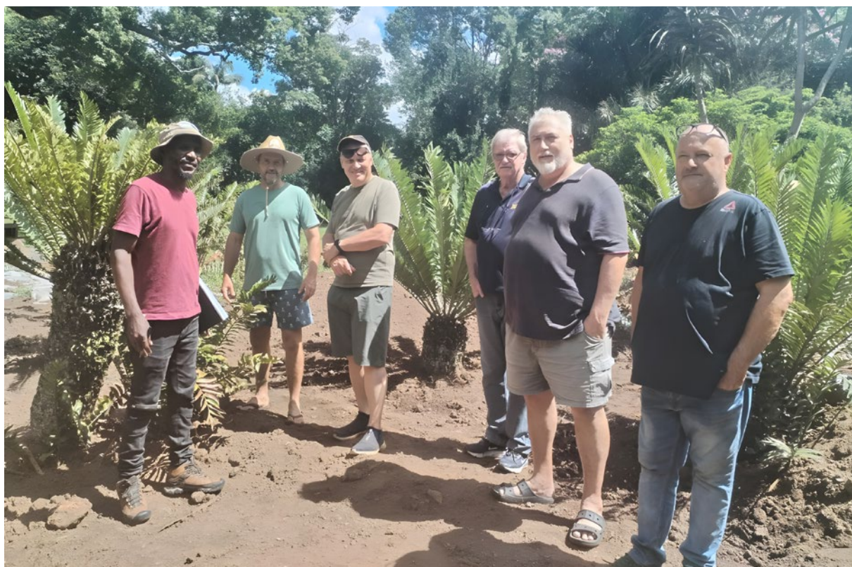
Figure 2. Some suffering cycads (enthusiasts?).