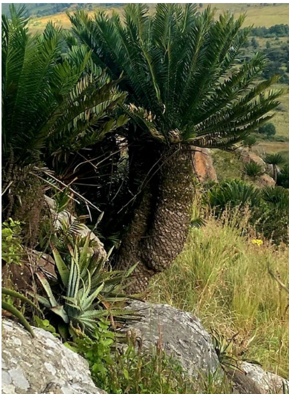
Figure 4. E. aemulans double stemmed plant in habitat.

However, it is under pressure from collectors and the situation could change overnight. The farmer has been farming with game and livestock for 30 years. He was hesitant to show us the colony of plants at first, until he heard that we were visiting from the distant Western Cape.