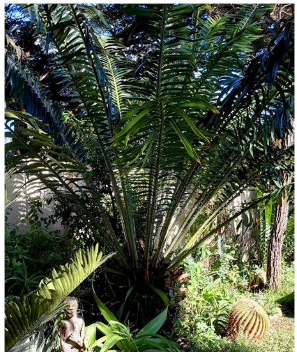
Figure 17. E. laurentianus in Tony Edwards' garden.