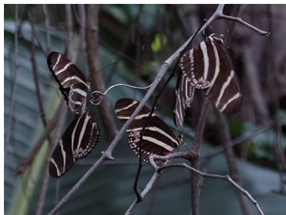
Figure 5. A nightly roost of Heliconia.

fritillaries, respectively), I planted food plants for both the larvae and the parents. These include one species of passiflora ( Passiflora suberosa ) and three species of Hamelia ( patens , patens var. glabra , and cuprea ). Also, while the palms ( Chrysalidocarpus pambana , various Coccothrinax , etc.) serve as the overstory to dapple the sunlight, several species