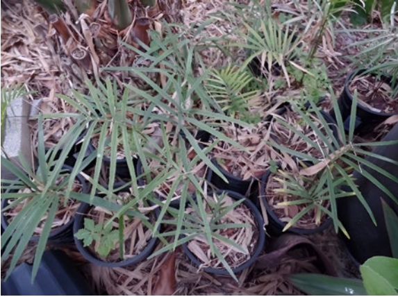
Figure 12. Seedlings of Z. portoricensis .