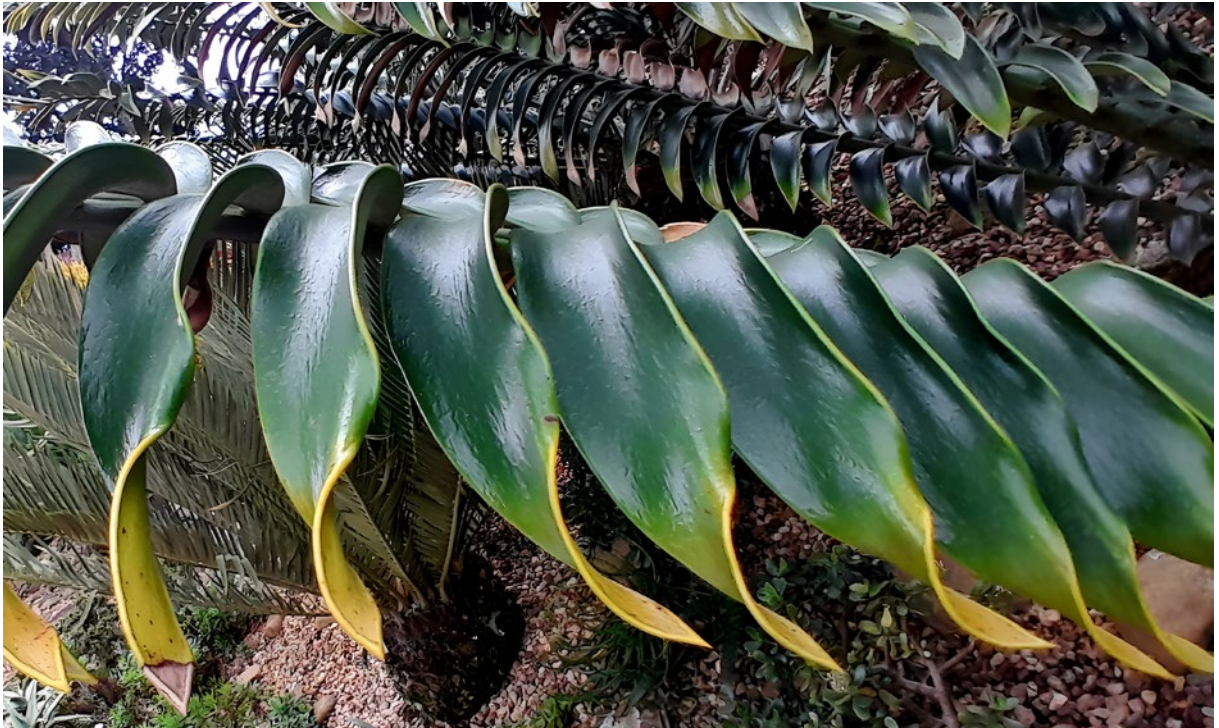
Figure 26. Leaflets of E. natalensis “Umgeniensis” in Peter’s garden. This form is now extinct in habitat which was flooded by the Inanda Dam.

poaching. We were lucky to see a large population of E. senticosus hanging from the steep cliffs of the Lebombo mountains and found a plant in cone next to the road.