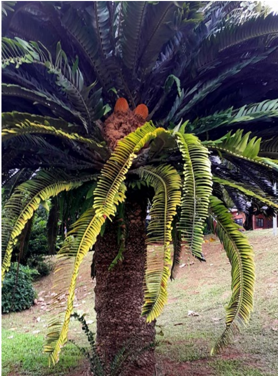
Figure 21. E. woodii with male cones in the Durban Botanic Gardens.