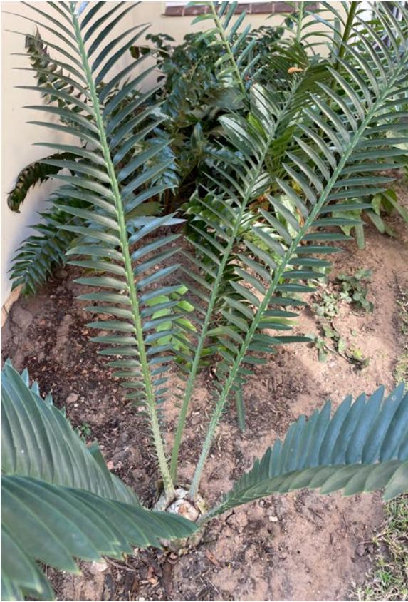
Figure 6. E. bubalinus .