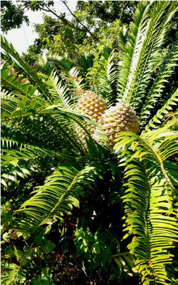
Figure 12. E. senticosus found next to the road near Jozini.

The farmer is also a big game hunter with many trophies in his house. He showed us a trophy of the lion which he shot a few years ago near the hill where the colony of E. aemulans grows. The lion was a threat to cattle in the area.