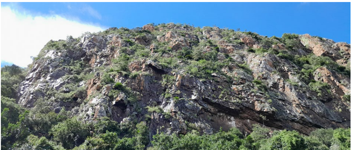
Figure 11. E. senticosus plants hanging from the cliffs.

E. natalensis and E. senticosus . The specific epithet is derived from the fact that the male and female cones are very similar. The length of the median leaflets is more than six times its width, but we noted quite a variation even in this small colony.