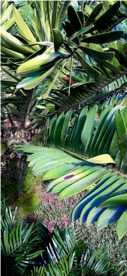
Figure 18. E. natalensis Vryheid form in Tony Edwards' garden.