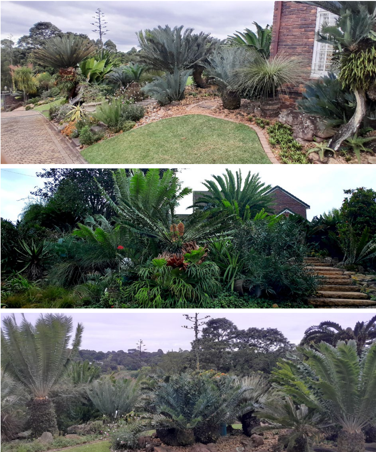
Figure 25. The beautiful garden of Peter and Mara.

to the road overlooking the Jozini dam, formerly Pongolapoort dam, en route to Jozini. The area is known for E. senticosus . Many specimens of this species were translocated due to expected flooding of its habitat by the dam. The plants also attract the attention of cycad collectors resulting in illegal