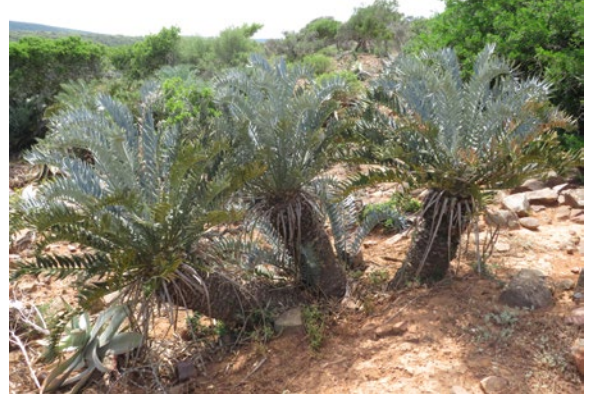
Figure 1. This plant appears to be Encephalartos trispinosus but grows nowhere near the distribution of that species. The stout stems remind one of E. lehmannii but the leaves do not resemble the species. This is a single plant.

WCC is working with government partners and private collaborators to help bring back our extinct species, eventually, as well as to protect species where necessary. This is an expensive exercise, and we are dependant on donations from generous people from around the world. Wild Cycad Conservancy is a registered Public Benefit Organisation and donations are tax deductible. If you can or want to contribute, please contact the author or see our website for more information, www.wildcycad.org.za .