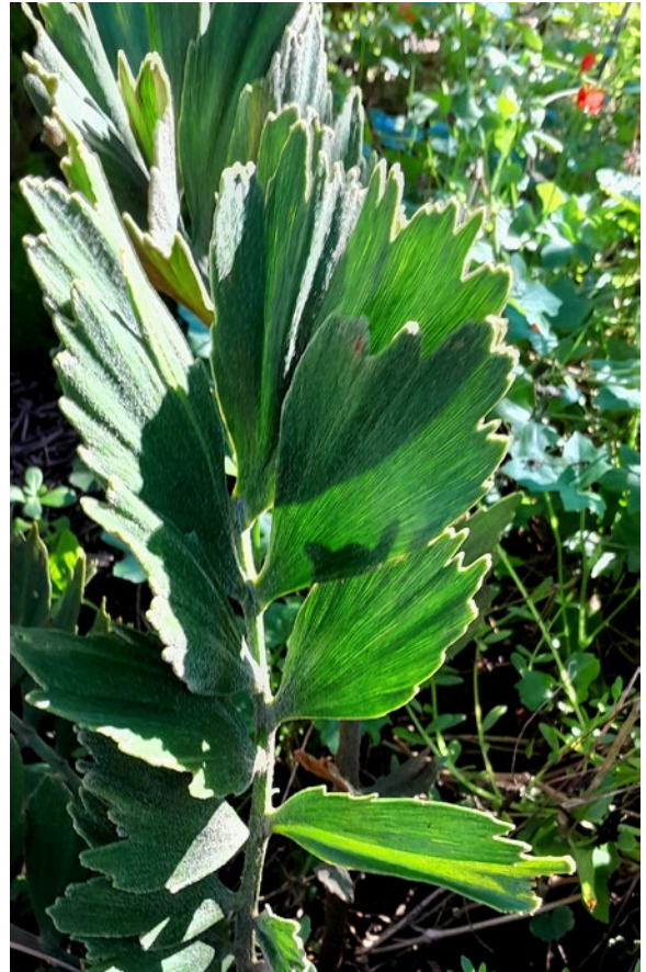
Figure 15. Zamia furfuracea in Tony Edwards' garden.