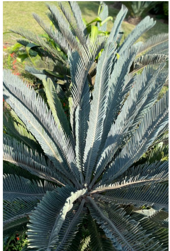
Figure 3. Beautiful blue cycads.