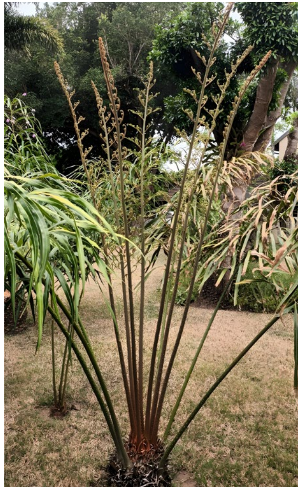
Figure 8. Cycas debaoensis (China).