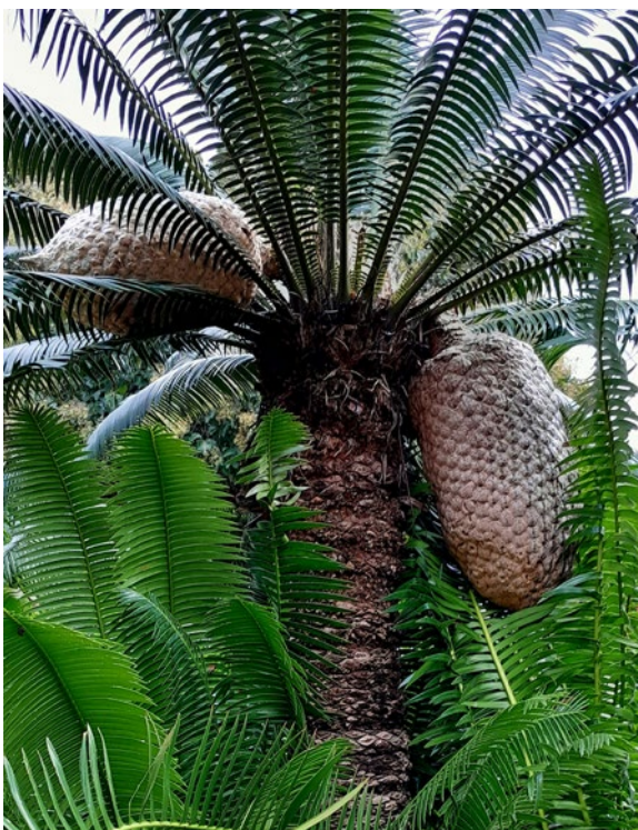
Figure 23. Dioon spinulosum female cones in the Durban Botanic Gardens. These cones can weigh up to 90 kg.