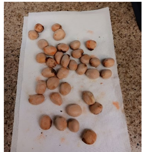
Figure 11. Fresh seeds ( Z. inermis ).