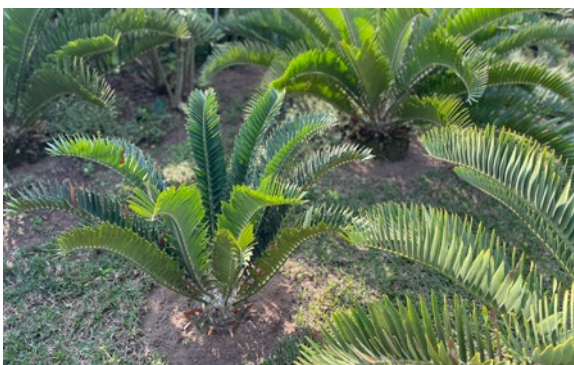
Figure 4. E. longifolius variation.