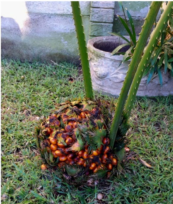
Figure 16. Cycas bifida seed cone in Tony's garden. The habitat of this species is on the China-Vietnam border, and it is classified by the IUCN as vulnerable (VU).