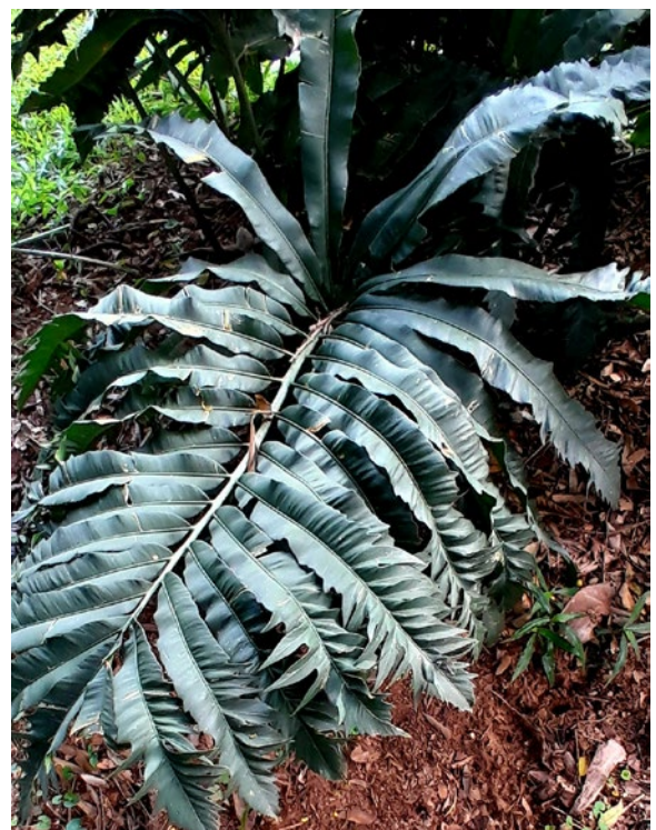
Figure 24. Stangeria eriopus has two forms, the Forest and Grassland form. This is the forest form with bigger leaves and dentate margins.