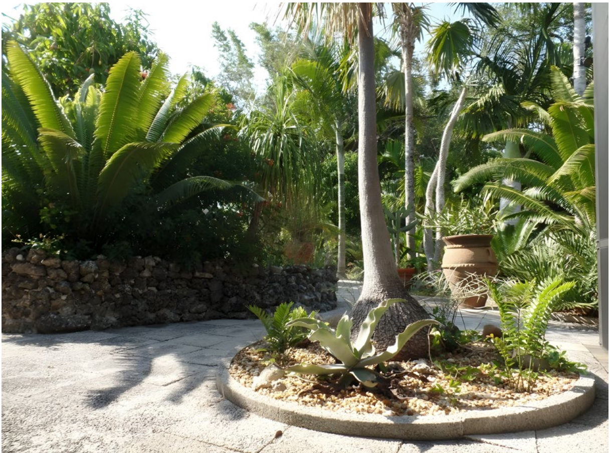
Figure 1. One view of a south Florida garden during spring, dedicated to preserving and propagating rare and endangered cycads and palms. Foreground: two Zamia pygmaea , behind those are two Z. angustifolia . Note the passiflora growing between and within the cycads. By early summer, the passiflora is lush and abundant, as in Figures 2 and 3. Midground (L and R): two Dioon spinulosum . Background: Z. loddegesii (in ground at right), and Z. lucayana in clay pot. Most of these plants have been used for propagation and hybridization.

the Coontie here in Florida, which can live over one hundred years. Growing plants of this type—ancient ones whose ancestors lived hundreds of millions of years ago—and knowing how tenuous their existence is today, we are awed by the sense of deep time they possess, and are troubled to find how rare they are in both nature and cultivation. Today, of the approximately 375 accepted species,