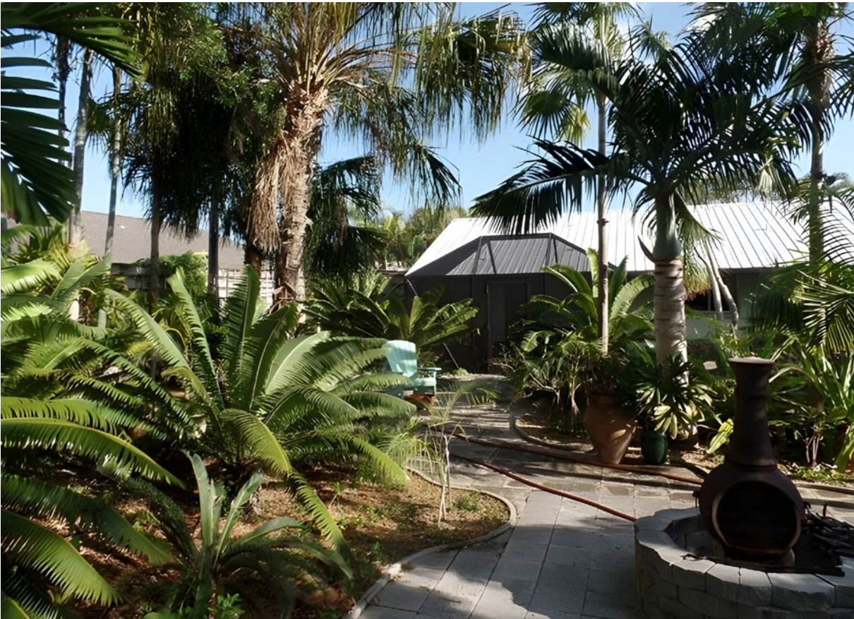
Figure 14: A view of a diverse, semi-tropical garden in southwest Florida, USA, containing rare palms and cycads.

like books and videos is helpful, talking and working side by side with a dedicated, experienced gardener has no substitute. Lastly, building relationships with other growers and gardeners can also help with a critical part of your garden's legacy: a survivorship plan. After you are gone, who will care for "your" plants when you no longer can?