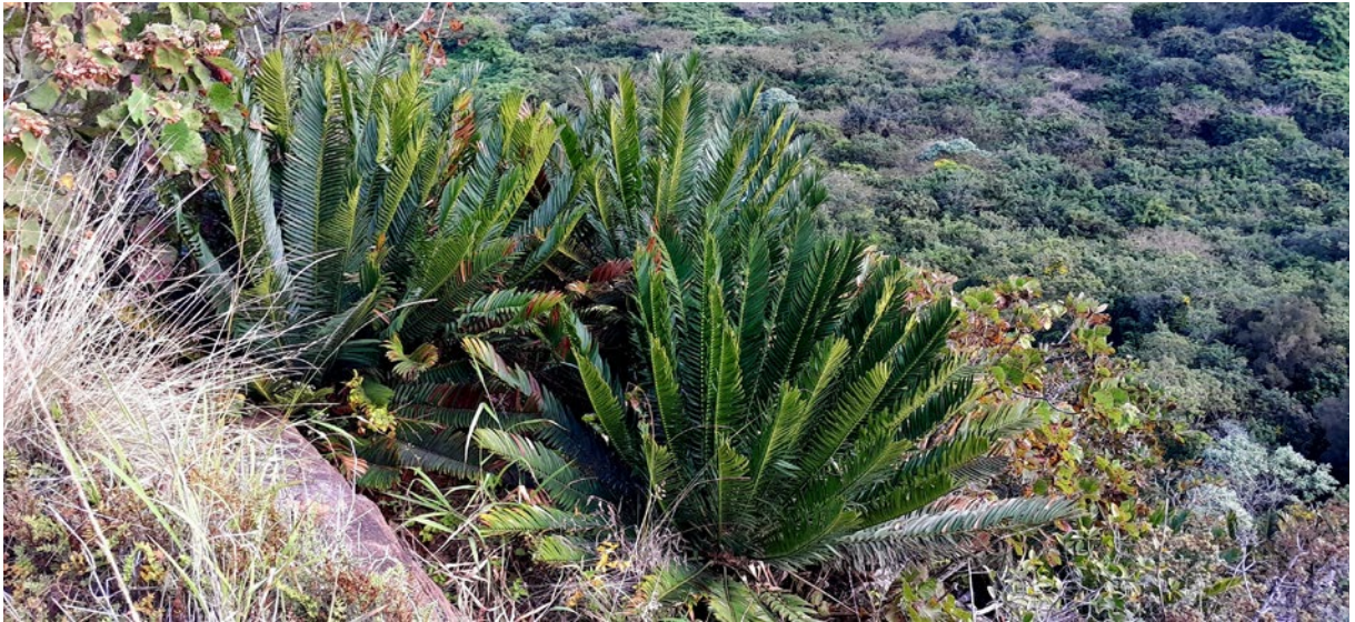
Figure 3. E. aemulans in its natural habitat.

in habitat exists. The plants were restricted to a single hill, growing on the steep, south facing sandstone slopes. Plants also grew at the base and made genuine cycad forest. Many specimens still exist, some more than 2m in height. The colony is clearly flourishing, and seedlings were observed.