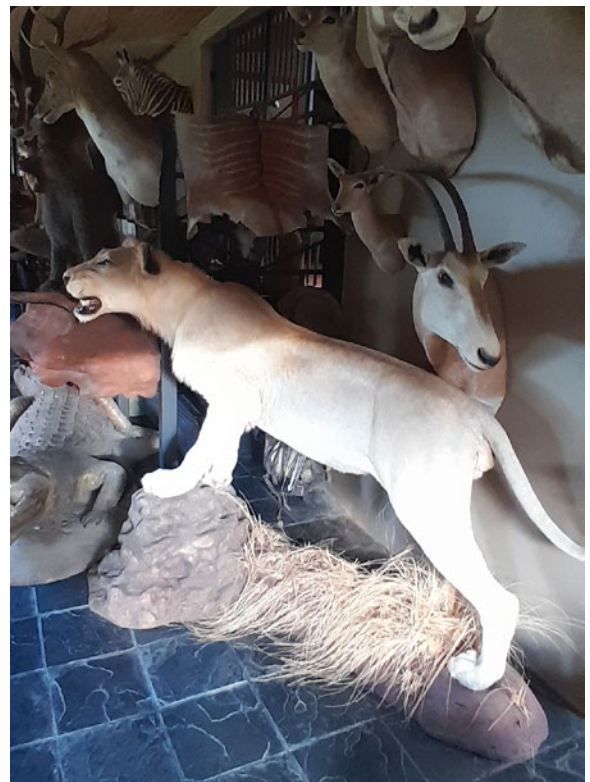
Figure 5. A Lion Trophy - lioness shot near the E. aemulans colony.