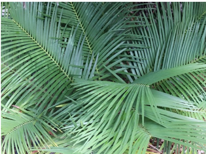
Figure 10. Male Z. inermis .