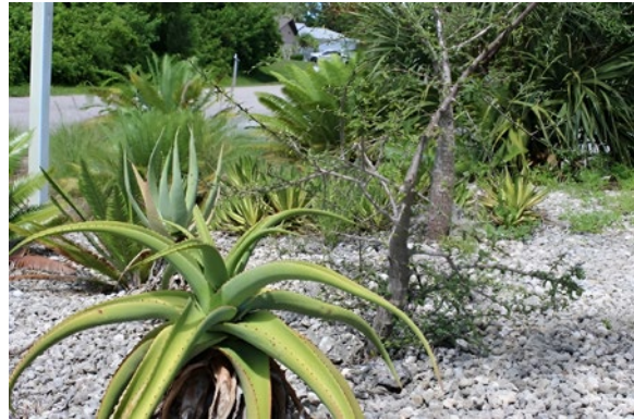
Figure 18: Group of Dioon sp.; various palms, tree aloes, agaves, Dioons , and 'Elephant trees': Operculicarya decaryi .

overall planting scheme is continued from the wetter area, the plant selection is modified to accommodate a drier habitat. Choosing succulent or dry-land habitat species is important in this case. For example, when considering drought-tolerant palms (Riffle & Craft, 2003), many Copernicia , Livistona , Phoenix , Sabal , and Thrinax species are potential options. As for cycads, Jones (2002) writes that various species of " Cycas , Dioon , Encephalartos and Macrozamia " (p.15) can be observed living in xeric habitats.