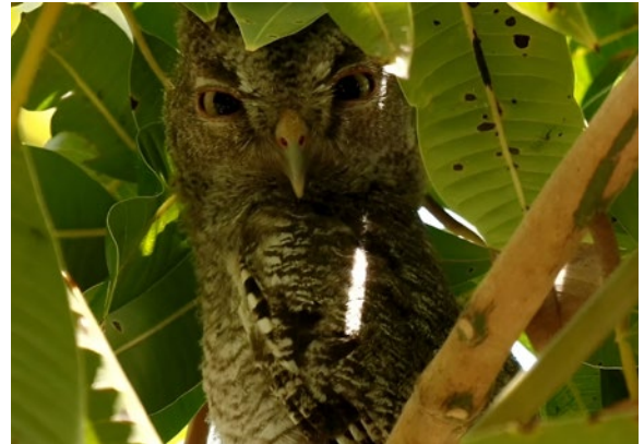
Figure 16: Owllet resting in a mango tree.