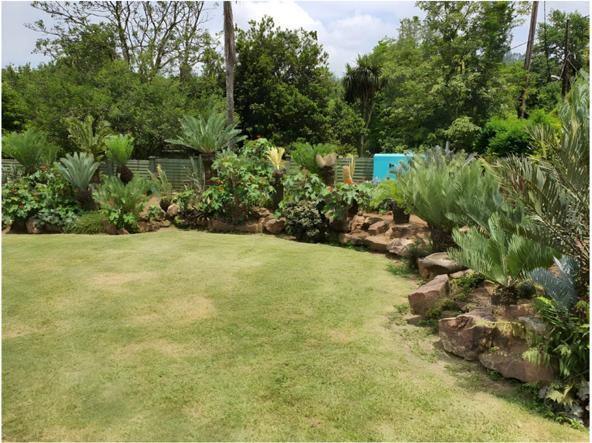
Figure 5. ...and more!

is thought to be a hybrid between E. natalensis Kloof and E. woodii Kloof. Ed] growing right next to each other, is an exceptional sight. This was just the start, since Paul's collection contains all the South African species. His plants are well established in this beautifully laid out and well-planned garden.