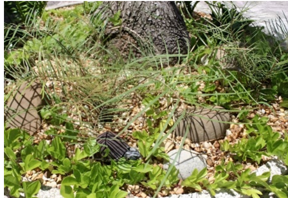
Figure 2. Matched pair of Z. angustifolia .