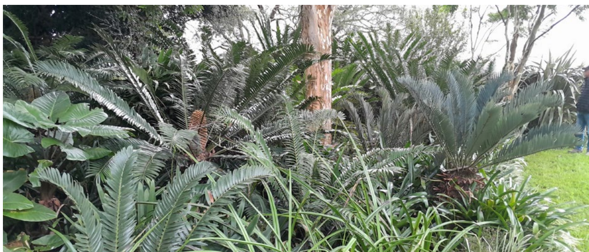
Figure 7. Coenie Swanepoel's cycad garden.