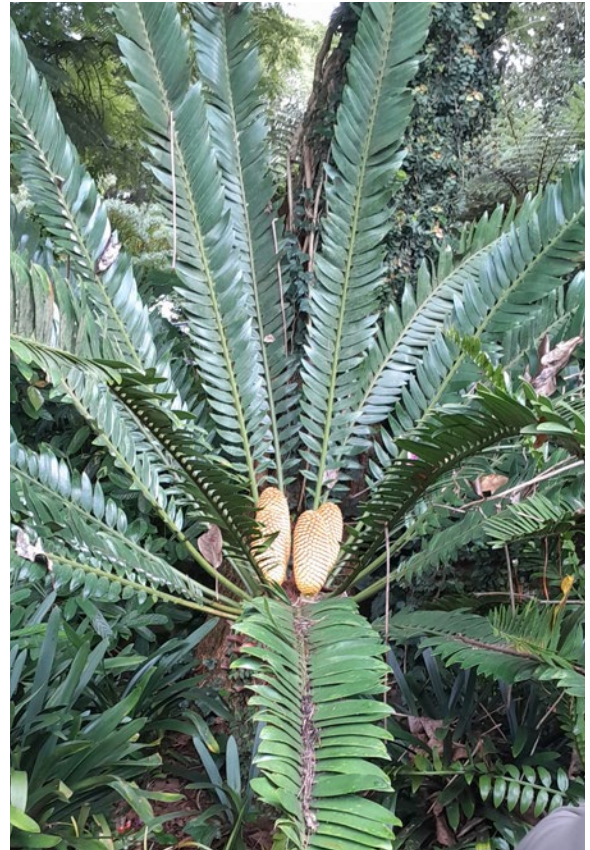
Figure 10. A younger E. natalensis Squebezi in the Mentz garden.

E. aemulans is commonly known as the “woolly natalensis” with brown wool on the stem apex. It is difficult to identify this species when it is not in cone because it can easily be confused with E. lebomboensis , E. msinganus , some forms of