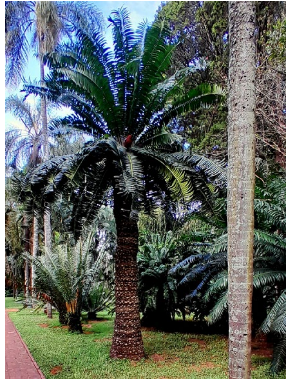
Figure 22. E. kisambo , the cone has a brown reddish colour similar to E. gratus or E. tegulaneus .