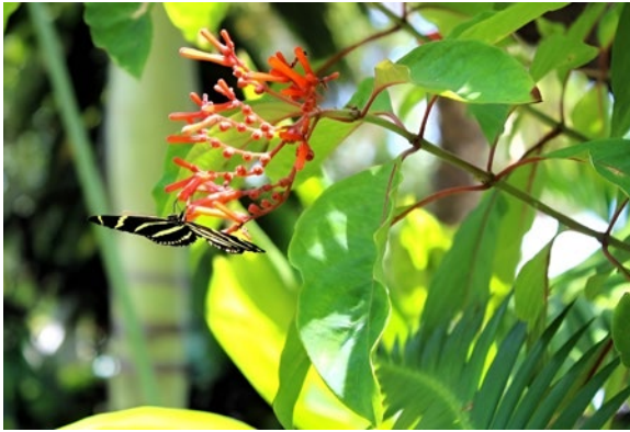
Figure 6. H. charithonia feeding on Hamelia sp.