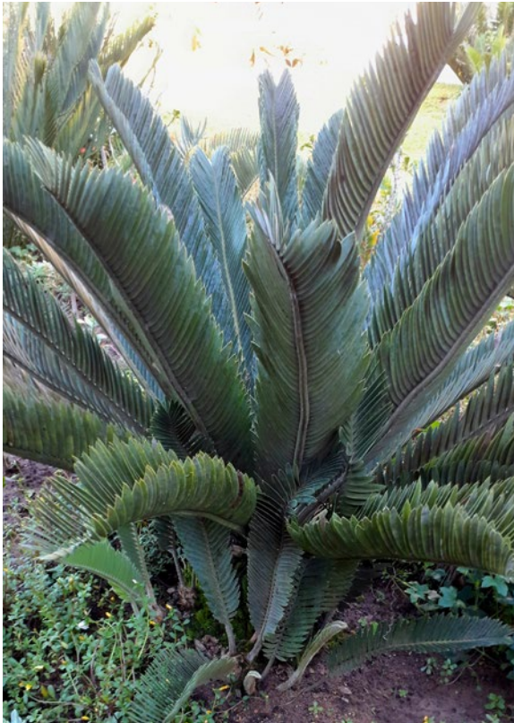
Figure 14. E. hirsutum with suckers in Tony Edwards' garden.