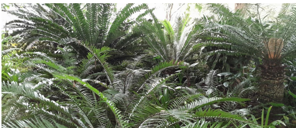
Figure 8. Coenie Swanepoel's cycad garden.