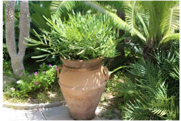
Figure 9. Male Z. lucayana with Pachypodium sp. on left; D. spinulosum on right with Z. loddigesii below.