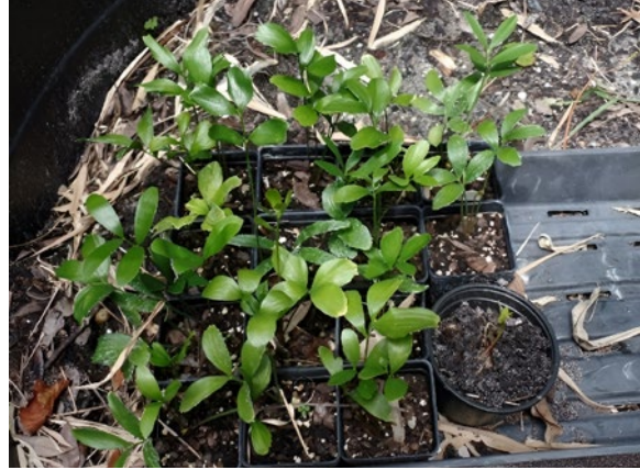
Figure 13. Z. pygmaea seedlings, given to friends.

becomes one of the highest aspirations for an experienced gardener, and the last stage of the life of a gardener. It is important to recognize individuals who will be interested in, and responsible for, continuing the plant's lifespan and future possible progeny. These future curators must be inspired by the current generation. Though sharing resources