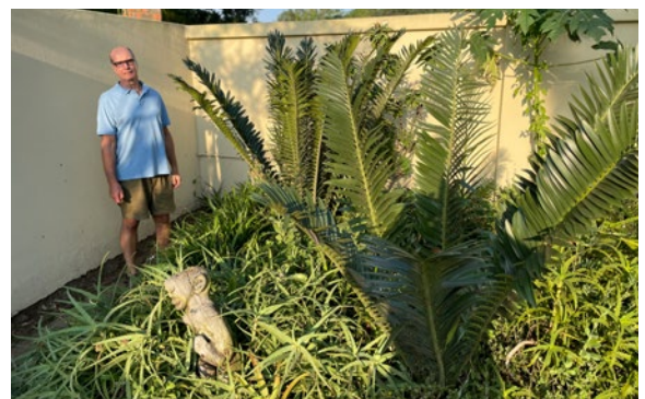
Figure 5. E. turnerii .