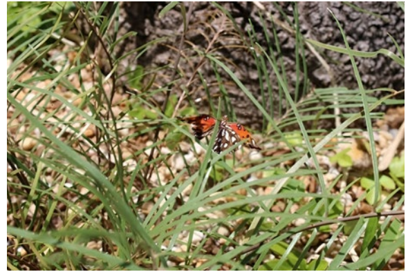
Figure 7. D. vanillae , newly emerged, unfurling wings.

of Zamia and Dioon , along with the Hamelia , are used as scaffold plants for the diminutive, clambering passiflora (see figures 2, 3, and 6). A mature Dioon angustifolium (figure 4) provides: (1) a nursery environment for the Heliconias with shade and spiny protection, and (2) structural support for this dependable passiflora, the food plant of choice for the larvae. This passiflora, the corky-stemmed passionflower, quickly regenerates its leaves after being mostly eaten by caterpillars, and can do so several times a year. The larvae attach their chrysalises to the underside of the Dioon 's leaves, which are favored spots to attach. Next, the new hatchlings have a ready supply of pollen and nectar close-by. This mutually beneficial grouping of plants fosters an amazing, long-term culture of these two butterfly species in my garden.