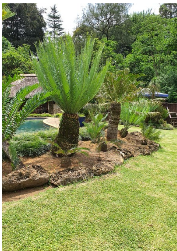
Figure 4. Some sights in Paul's beautiful garden.