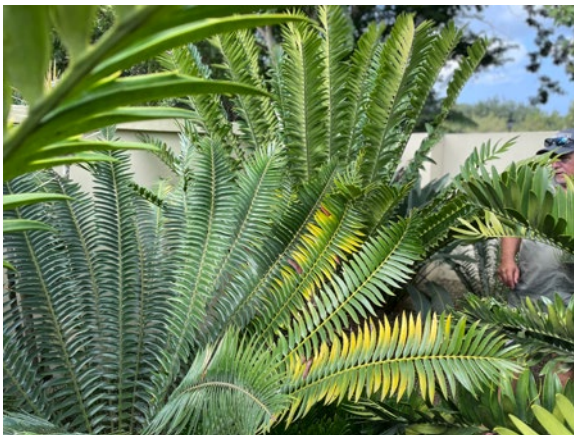
Figure 2. E. natalensis (Malakata form).