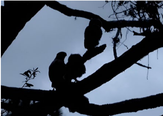
Figure 15: Puffed-up owllet and hungry hawk.