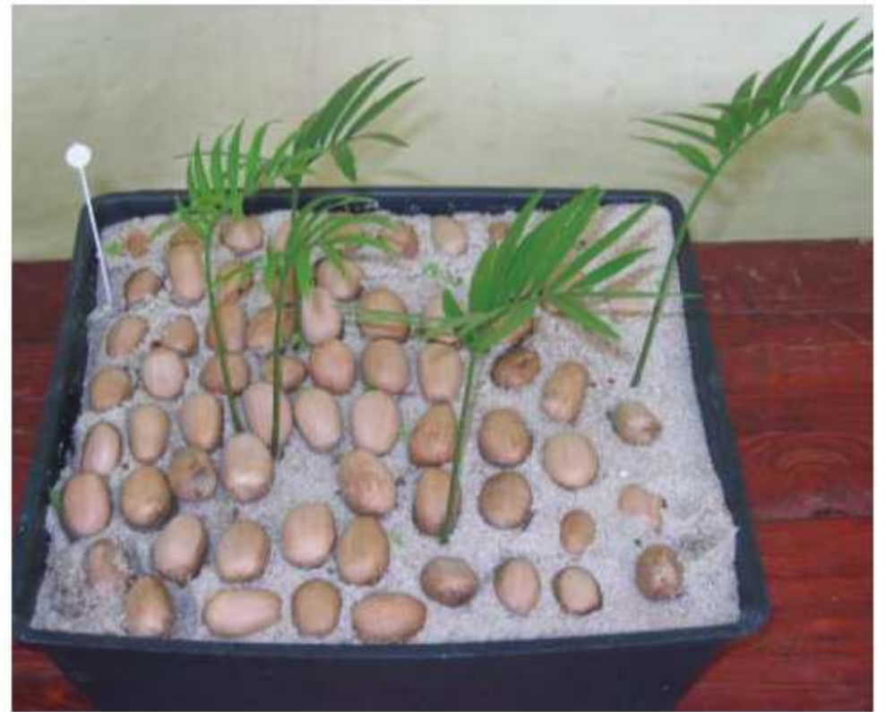
Figuur 6. —: Ontkieming van saad.

ly this information is unavailable. Hopefully a list will be made available after next year's sale.