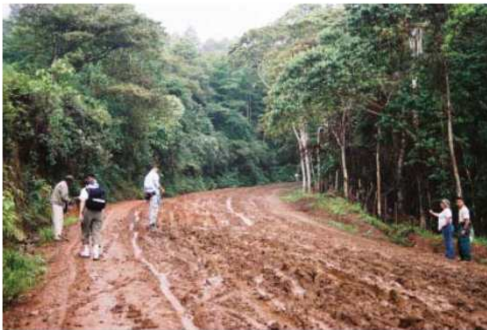
Figure 5.—: The road to Zamia oranreysii .

naked (Figure 8), i.e. without the remains of leaf bases, which are so characteristic of the stems of Encephalartos . There were a respectable number of plants, they are difficult to reach, and there seemed to be little pressure on them. Collectors already know about the plants and a considerable amount of seed destined for to be shipped to unknown clients, are harvested by locals. Later we found a local nursery where these plants are propagated quite successfully from wild-collected seed, and there is little reason why they cannot become common garden plants in Honduras as well as abroad.