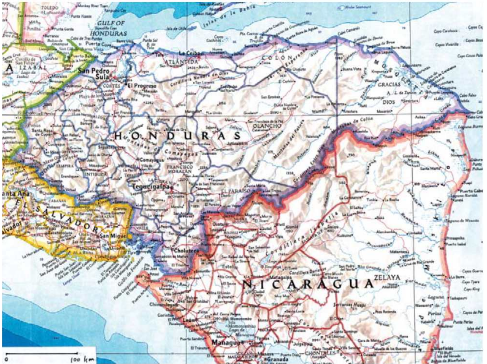
Figure 4.—: Honduras