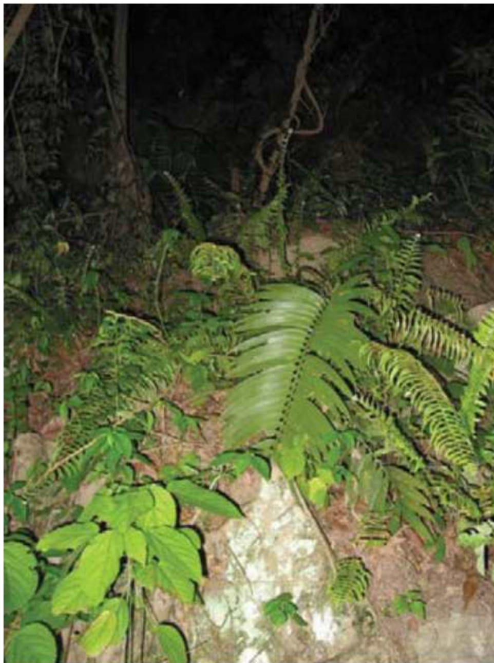
Figure 12.—: Zamia sandovalii : plant in habitat.