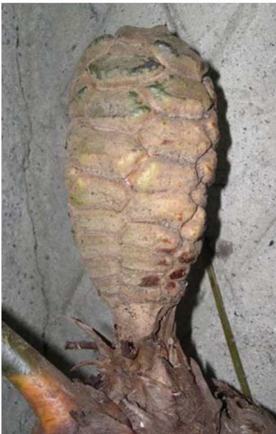
Figure 15.—: Zamia sandovallii : a female cone.