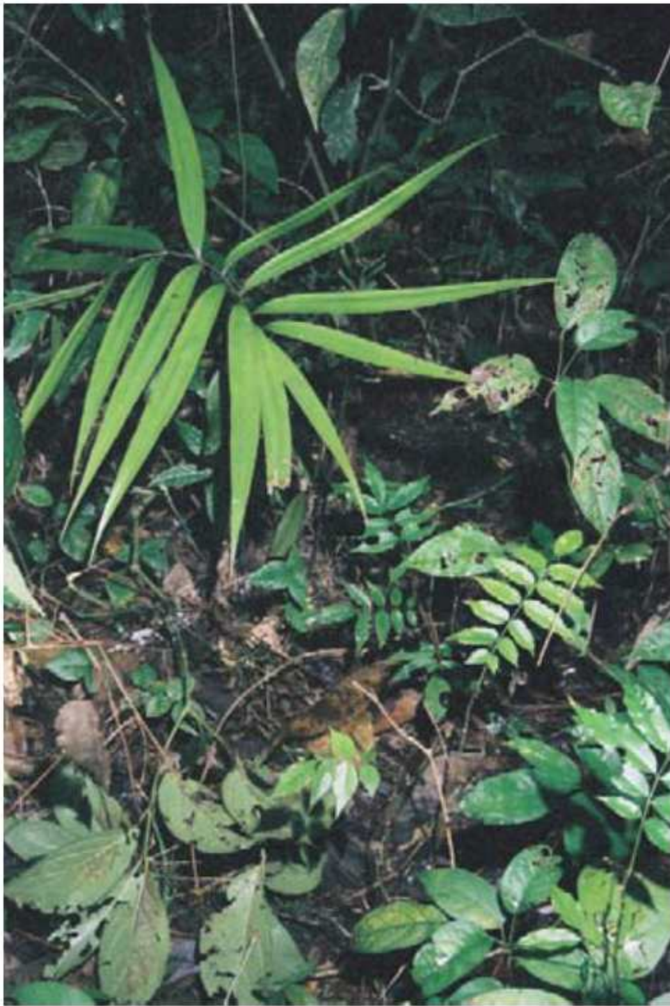
Figure 19.—: Zamia hererae in Honduras.