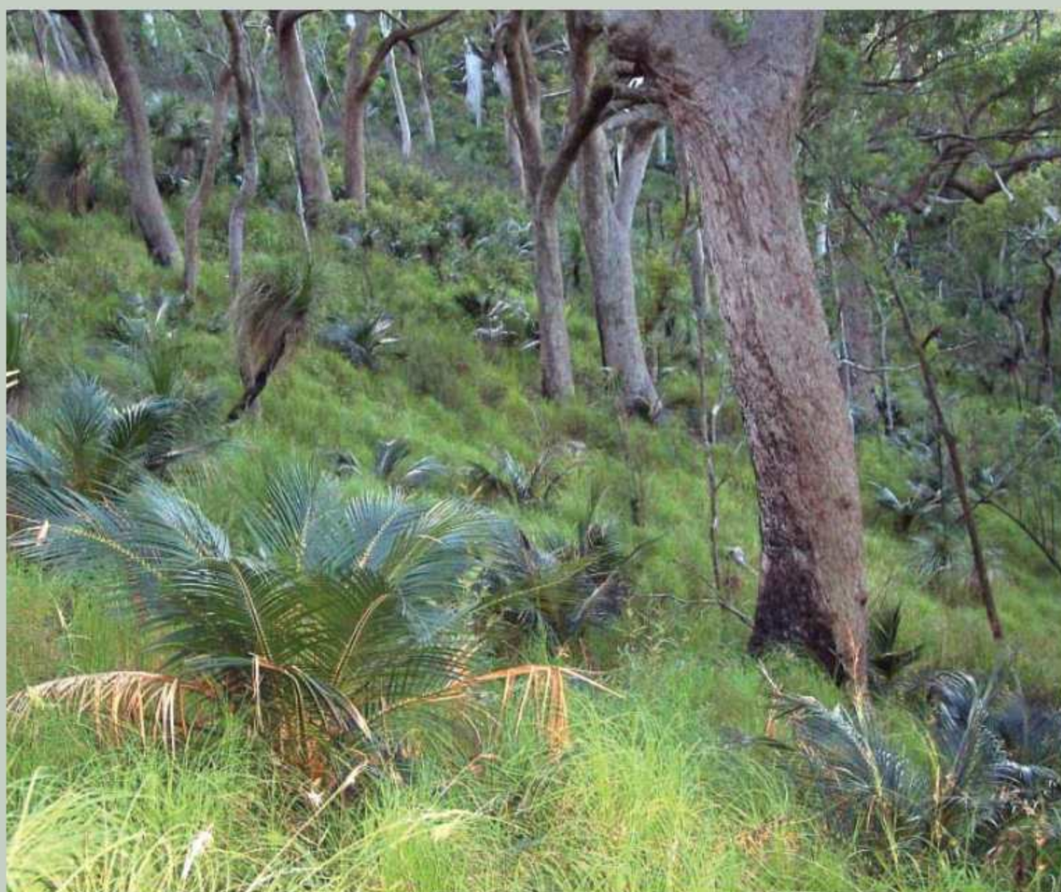
Figure 2. —: Macrozamia miquelii is found in fairly large populations on moderate to steep slopes such as this on Mount Archer, near Rockhampton. The plants here occur with grass trees ( Xanthorrhoea sp.) understorey to mixed eucalypt forest.