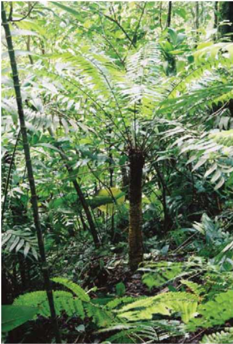
Figure 7.—: Zamia onanreysii in rainforest habitat in Honduras.