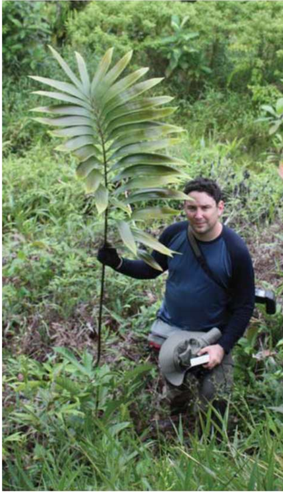
Figure 4.—: Zamia pyrophylla in habitat.