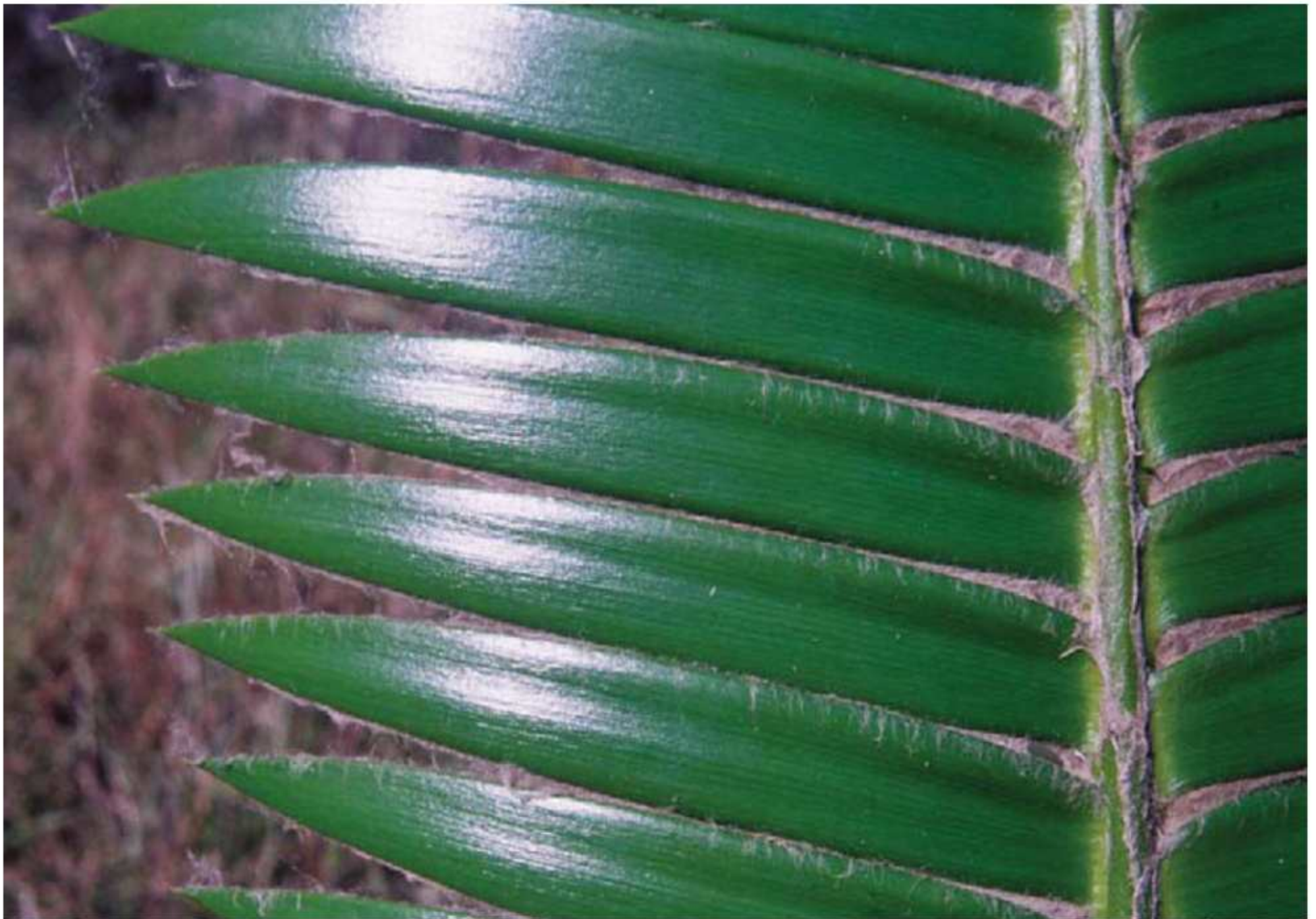
Figure 18. —: Dioon mejiae leaf detail. Note how green it is.