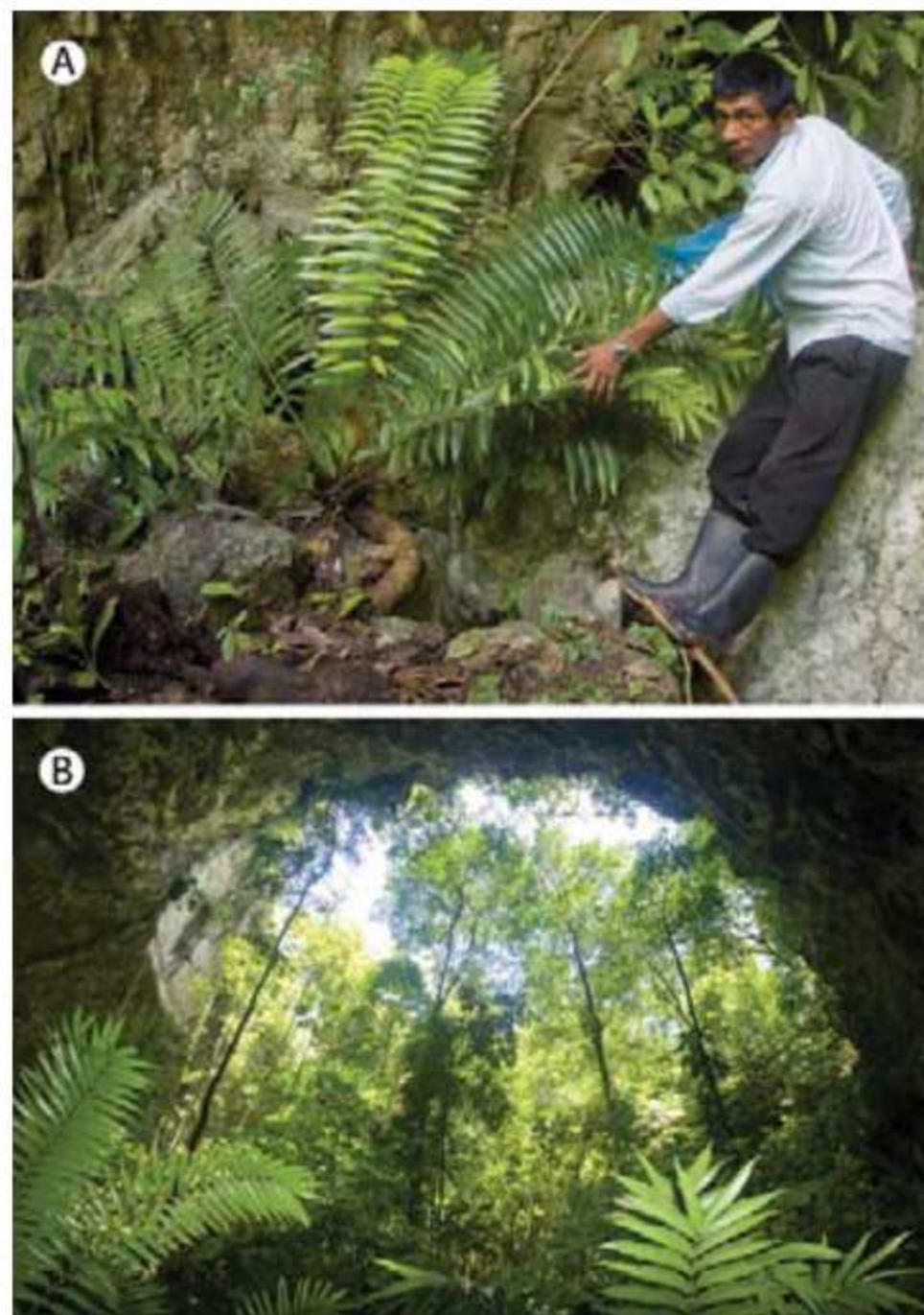
Figure 1.—: Zamia decumbens in habitat.

To some extent it resembles Z. cunaria and Z. ipetensis from adjacent Panama, all with seldom more than one leaf, underground stems, and various other similarities; but can be distinguished by its entire leaflets, its much longer leaves, and a number of other characteristics.