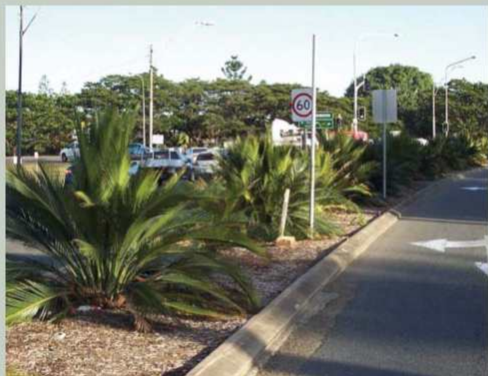
Figure 8.—: Macrozamia miquelii used to good effect in a median strip planting in central Rockhampton.