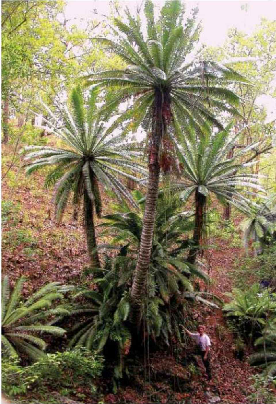
Figure 17. —: Dioon mejiae within a low evergreen forest in Honduras.

14). This Zamia has only one or two glossy leaves. Again, this species has recently been described under the name Zamia sandovallii .