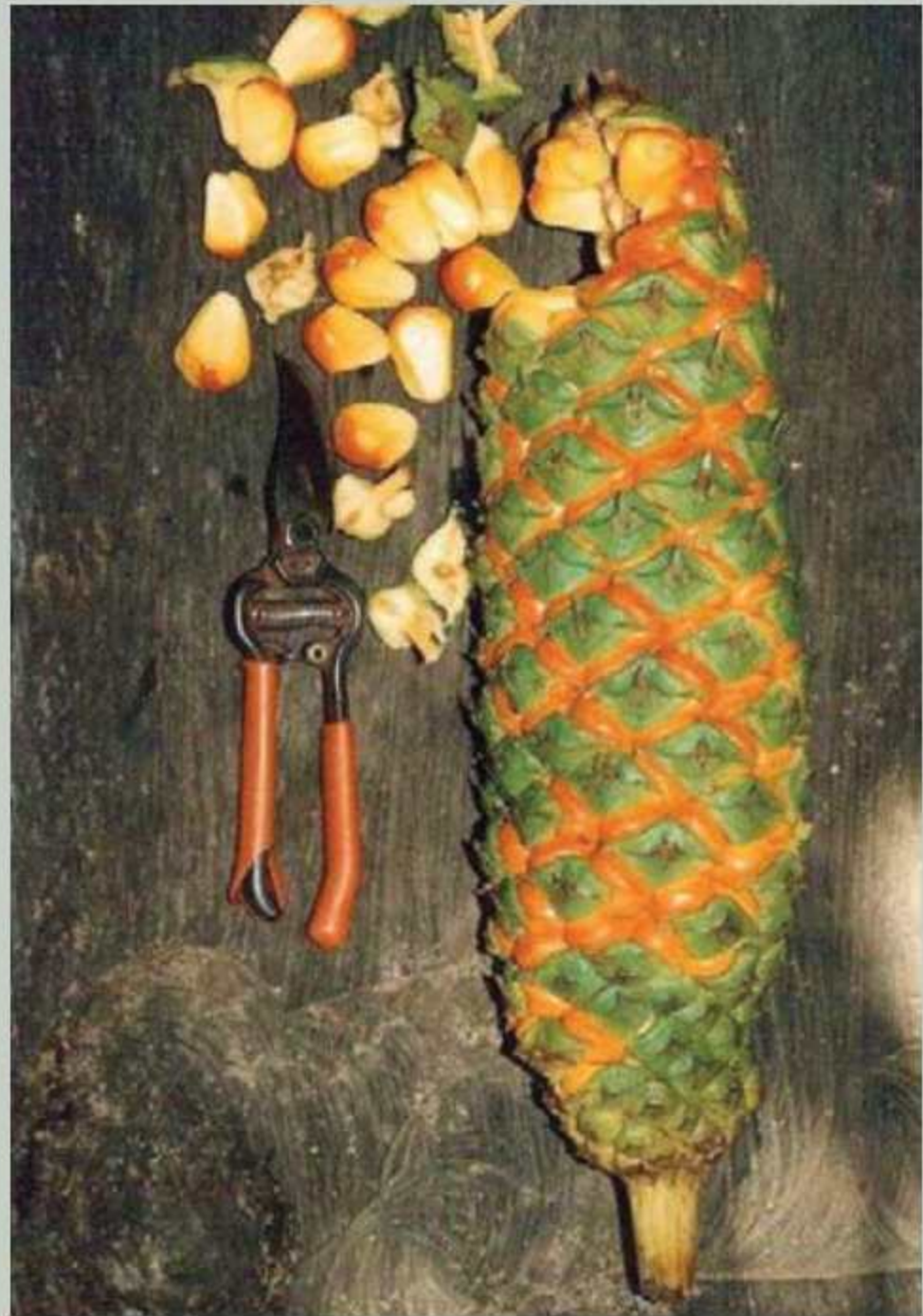
Figure 7.—: An ovulate Macrozamia miquelii cone shedding seeds, from a plant in cultivation in Rockhampton.