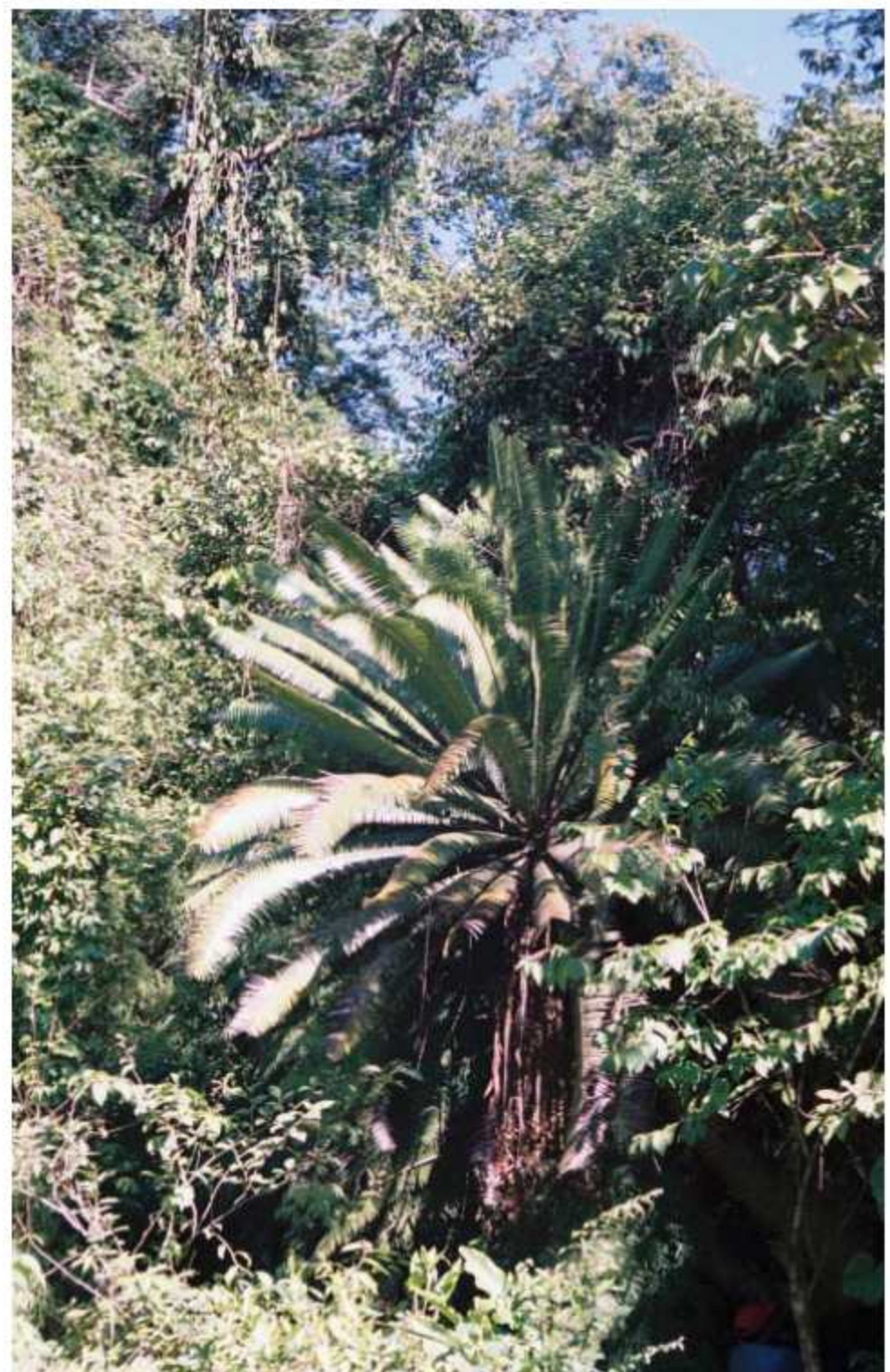
Figure 16.—: Dioon mejiae at a forest margin in Honduras.