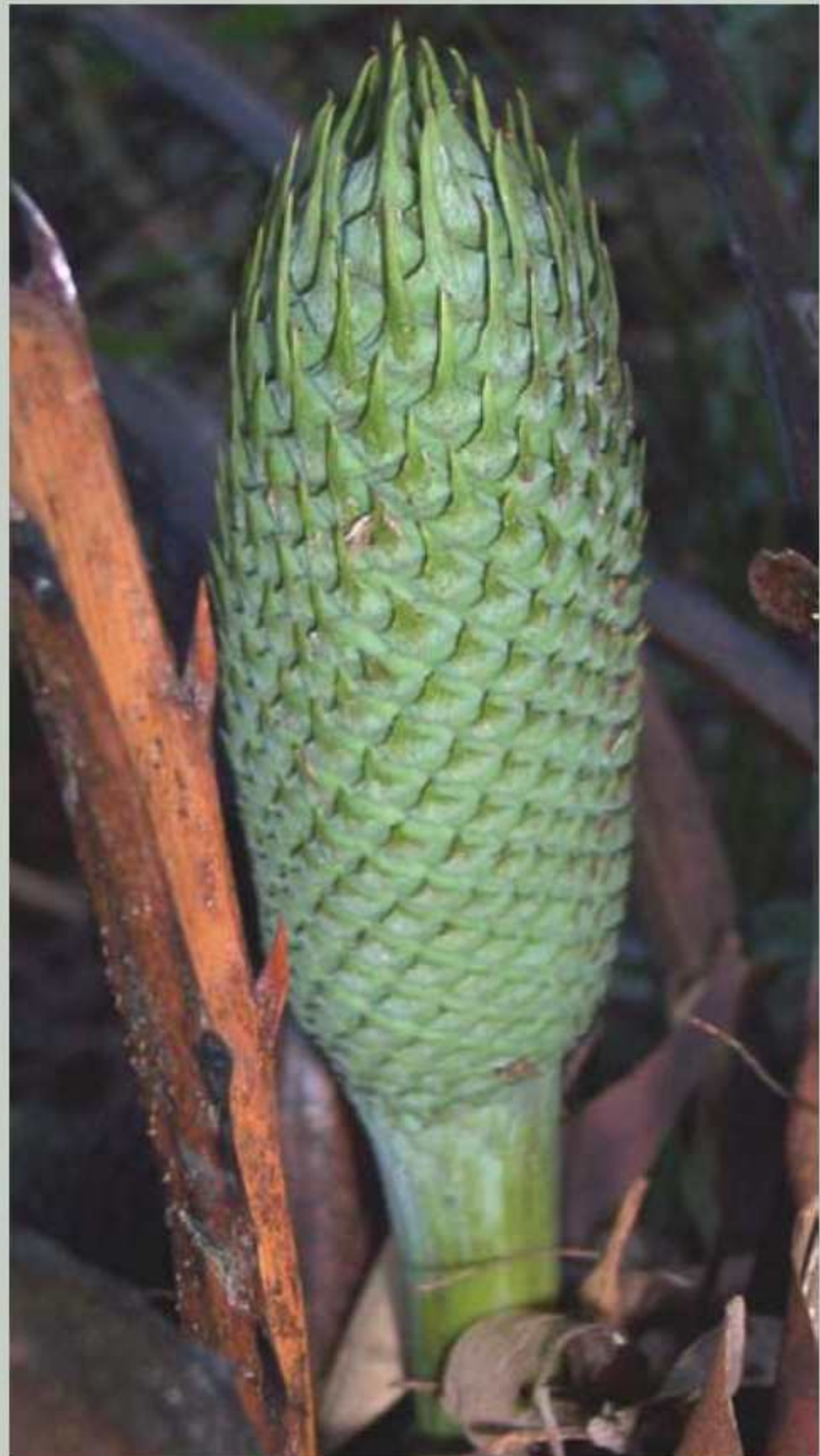
Figure 4. —: A newly-emergent Macrozamia miquelii pollen cone on a plant at Mount Archer.

Macrozamia miquelii grows at altitudes from sea level to 600 m in open forest or woodland dominated by eucalypts. The terrain varies from sloping and rocky in the west (Mount Berserker, Mount Archer and others in the Berserker Range) to near level and sandy at the coast (e.g. near Byfield). Dominant species at some localities are Corymbia citriodora and Eucalyptus crebra , at others it is Corymbia intermedia and Eucalyptus umbra . Soils