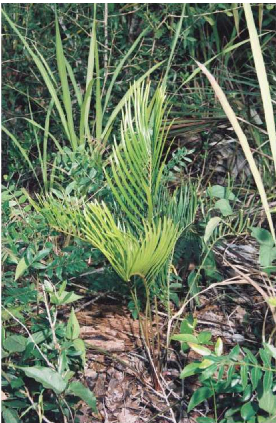
Figure 3.—: Zamia integrifolia in habitat at the Montgomery Botanical Center.

our visit only five species of cycad had been recorded in Honduras, and three of these were still undescribed. All these cycads are in the northern part, and personally I would not be surprised if many more lurk in the hinterland. Also of interest is that the Honduran Dioon mejiae occurs several hundred kilometers away from the closest Dioons (in Mexico).