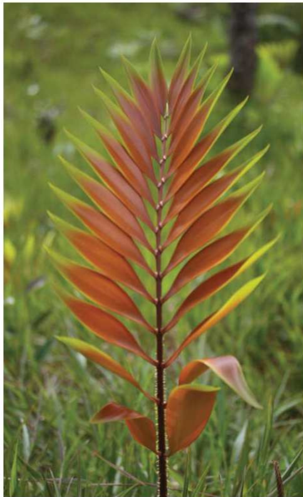
Figure 3.—: Zamia pyrophylla in habitat.

Subject to environmental changes and recurrent isolation in the last ca. 250 million years, cycads are often described as relics of a previously common lineage, with populations characterised by low genetic variation and restricted gene flow. The authors found that on the island of Guam, the endemic Cycas micronesica has most of the genetic variation of 14 EST-microsatellites distributed within each of 18 genetic populations, from 24 original sampling sites. There were high levels of genetic variation in terms of total number of alleles and private alleles, and moderate levels of inbreeding. Restricted but ongoing gene flow among populations within Guam reveals a genetic mosaic, probably more typical of cycads than previously assumed. Contiguous cycad populations in the north of Guam had higher