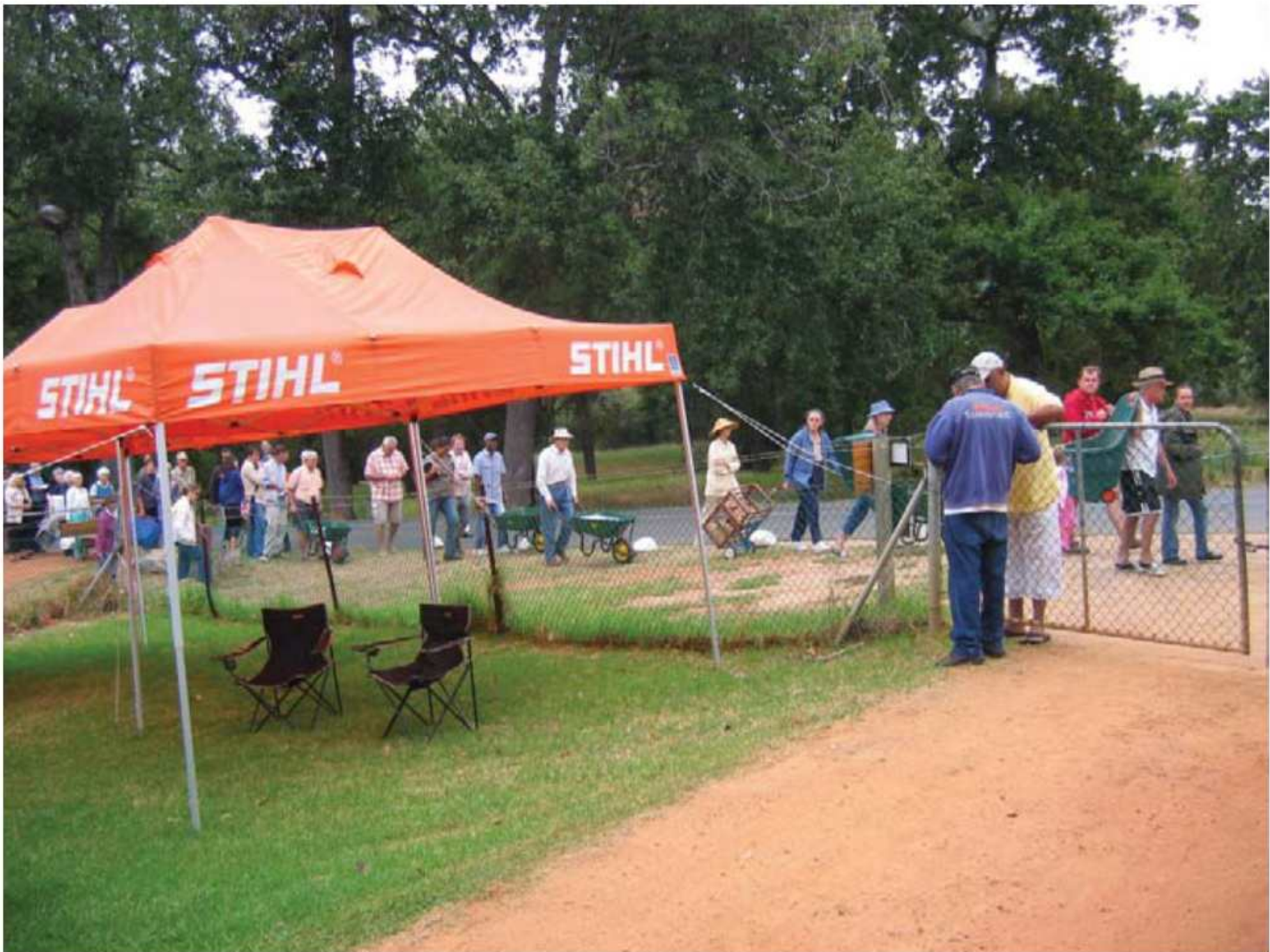
Figuur 1.—: Van vroeg oggend af is tou gestaan voor die hek.

Reeds van so vroeg as vyf uur die oggend van 20 Maart 2010 het die eerste persone (Figuur 1) hul plek voor die toegangshek ingeneem. Toe die hek teen negeuur oopmaak, was daar reeds 'n lang ry mense wat geduldig buite gewag het met 'n kruitwa, om hul dag se aankope na hul voertuie terug te neem. 'n Paar plante in plastieksakkies kan nogals swaar word as jy dit moet terug dra na jou voertuig.