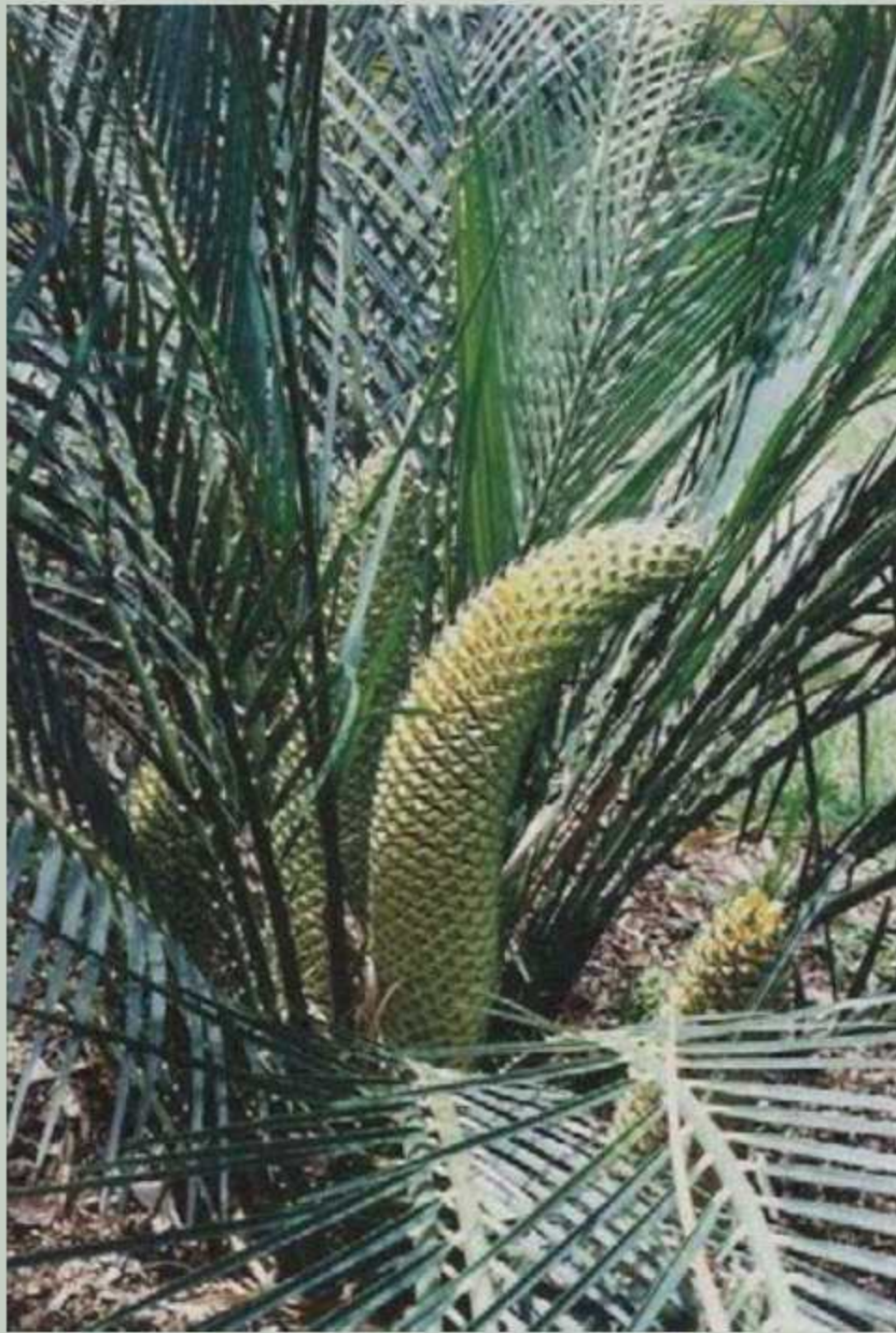
Figure 5. —: A Macrozamia miquelii plant in cultivation in Rockhampton, showing a series of pollen cones in different stages of development.