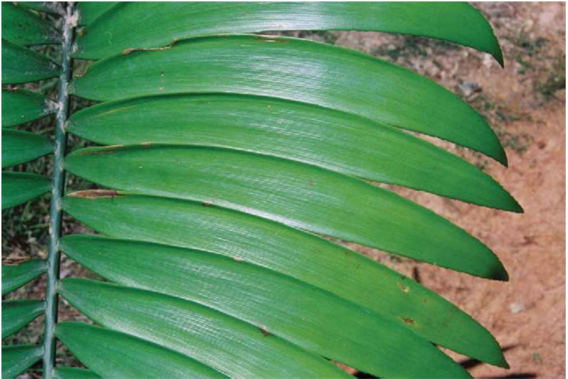
Figure 14.—: Zamia sandovallii : leaf detail.