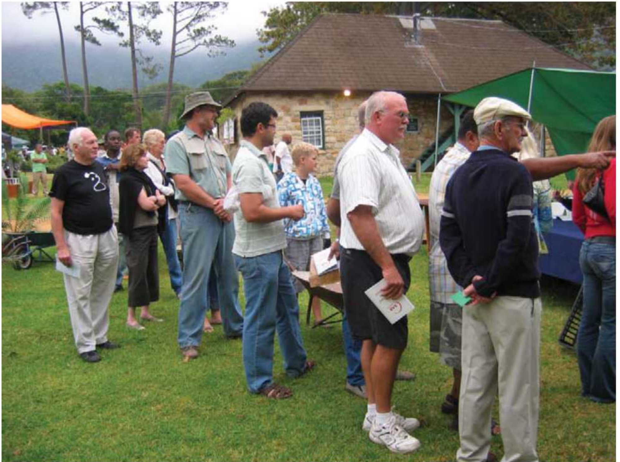
Figuur 2.—: Toustaan vir 'n broodboom