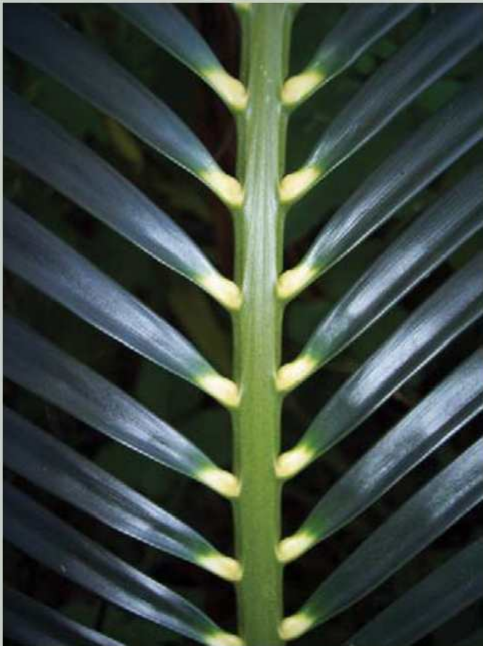
Figure 3. —: Leaf detail of Macrozamia miquelii showing the striking pattern created by the pale yellow callous swellings at each leaflet base. The suggestion that this pattern serves as a “flight path” for pollinating insects has no experimental support.

distribution of related macrozamia from north of Rockhampton southward into northern New South Wales.