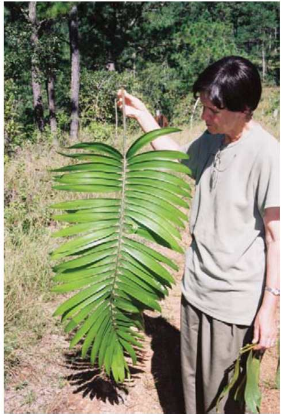
Figure 13.—: Zamia sandovalii leaf.

ing Belize there is a Ceratozamia called (perhaps wrongly so) C. robusta but there is a break of several hundred kilometres between the Honduran plants and the closest ones in Mexico. These plants were found in a patch of moist evergreen forest along a stream at a relatively low altitude, and surrounded by subsistence farming activities. This is one of the most startling Ceratozamia s I have yet seen. It is a big plant (Figure 10) with broad blue-green leaflets (Figure 11) which look very much like those of the Mexican Ceratozamia europhyllidia , but instead of a few erect leaves it has many more spreading-erect leaves, and my impression was that they are somewhat more thick-textured. No cones were found. We did not see many plants, and gained the impression that they are very localised. The habitat is by no means as secure as one would wish, and apart from thoughtless habitat destruction I can imagine that collectors would go to a lot of trouble to add this delectable plant to their collections. This species has now been described, under the name Ceratozamia hondurensis .