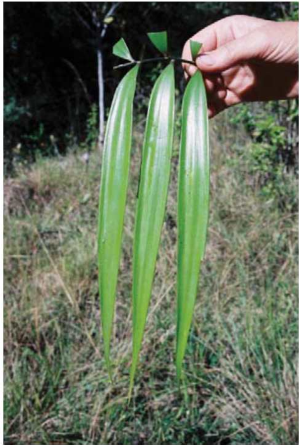
Figure 20.—: Zamia hererae in Honduras: leaf detail.

and looked very much like D. spinulosum in Mexico. They were big plants, up to 5 m tall, but Jody Haynes measured them elsewhere up to 10 m tall. This is an abundant species, and Jody estimated a total of about 50 000 plants. Its huge seeds have ethnobotanical value as a seasonal source of flour, and there are indications that it is respected by the users. There are also indications that, in spite of its forest habitat, it benefits from the opening up of the forest through grazing.