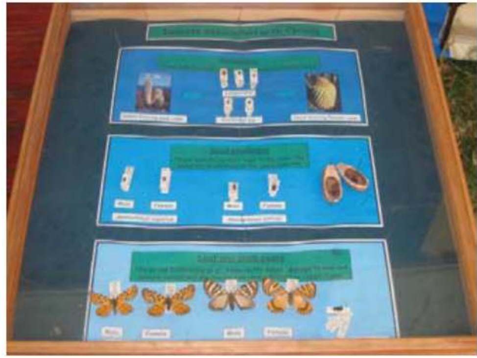
Figuur 5. —: Insekte geassosieer met broodbome