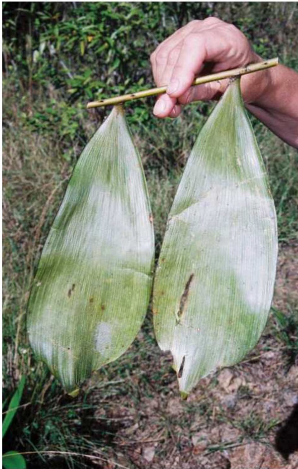
Figure 11.—: Ceratozamia hondurensis : leaf detail.