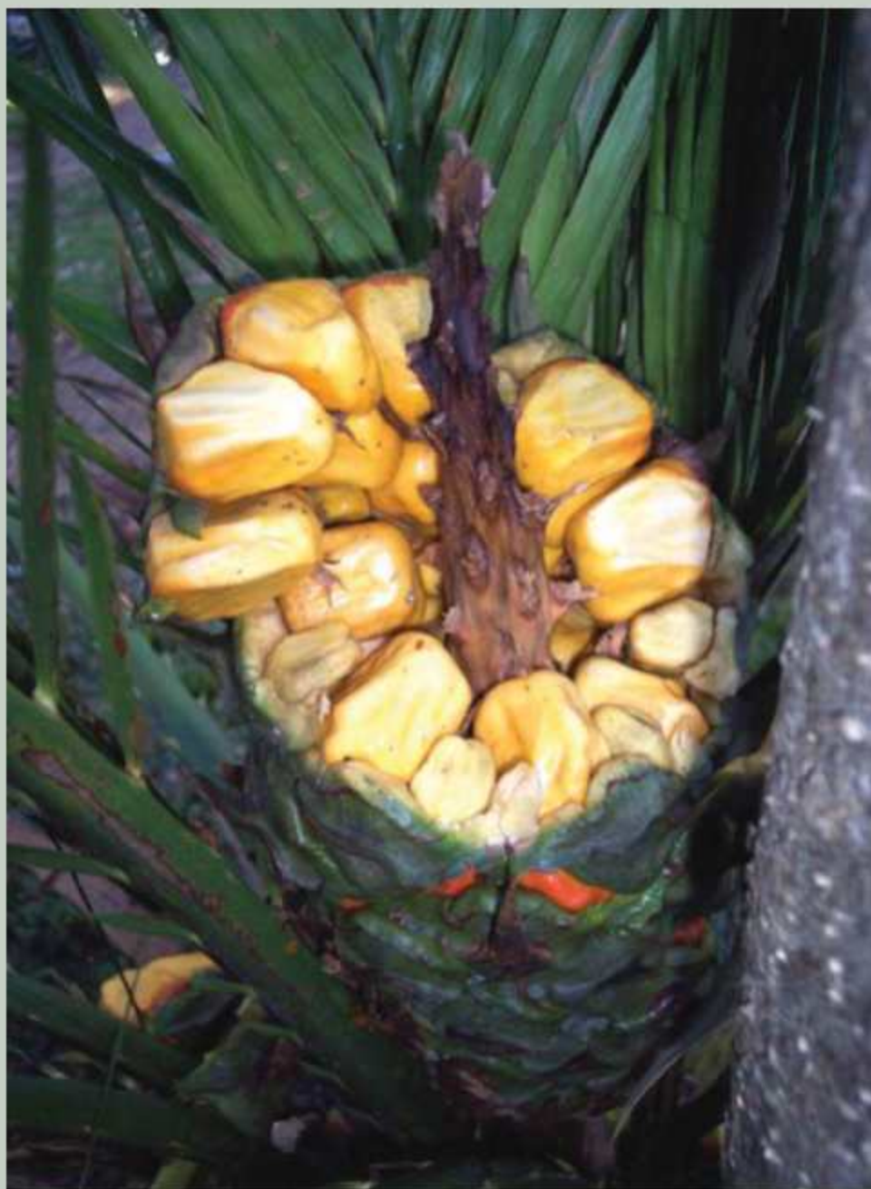
Figure 6. —: An ovulate Macrozamia miquelii cone at the seed-shedding stage, on a plant at Mount Archer.

rachis is straight, pale green, similar in cross section to the petiole, and bears 80–180 leaflets inserted at about 40° to the rachis. Leaflets are moderate crowded, closely-spaced distally but more widely spaced proximally, linear, 15–50 cm long by 6–12 mm wide, flat, thick-textured, with stomata on the abaxial surface only, with margins entire, tapering to a pungent apex, contracted at the point of attachment to a prominent whitish or pale yellow callous base, with lower leaflets gradually reducing to 6–16 pairs of rigid pinnacanth s.