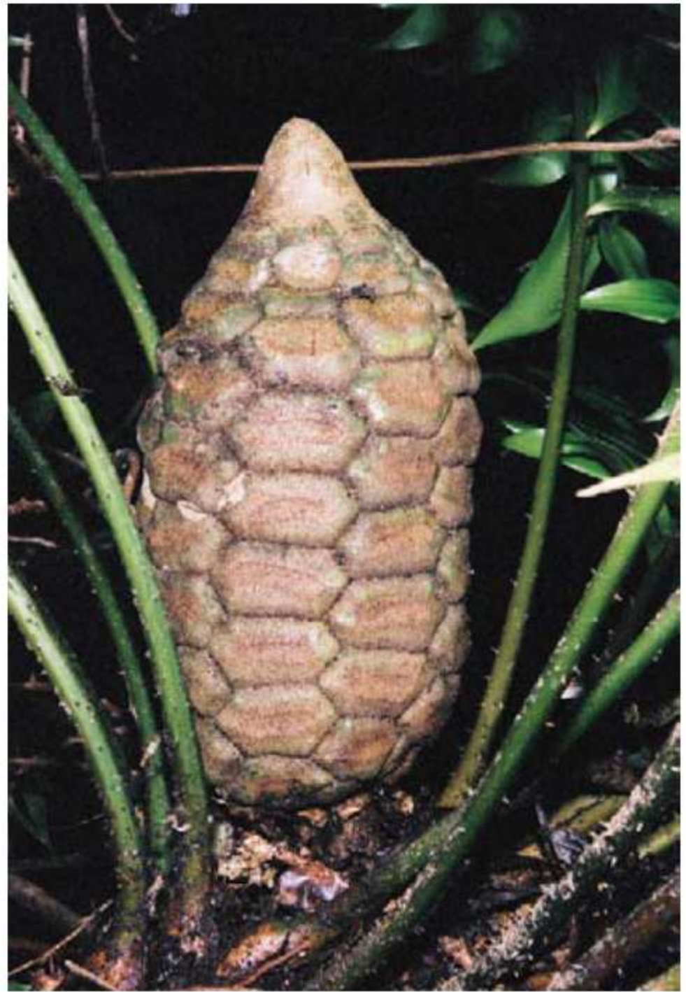
Figure 9.—: Zamia onanreysii in Honduras: a female cone.