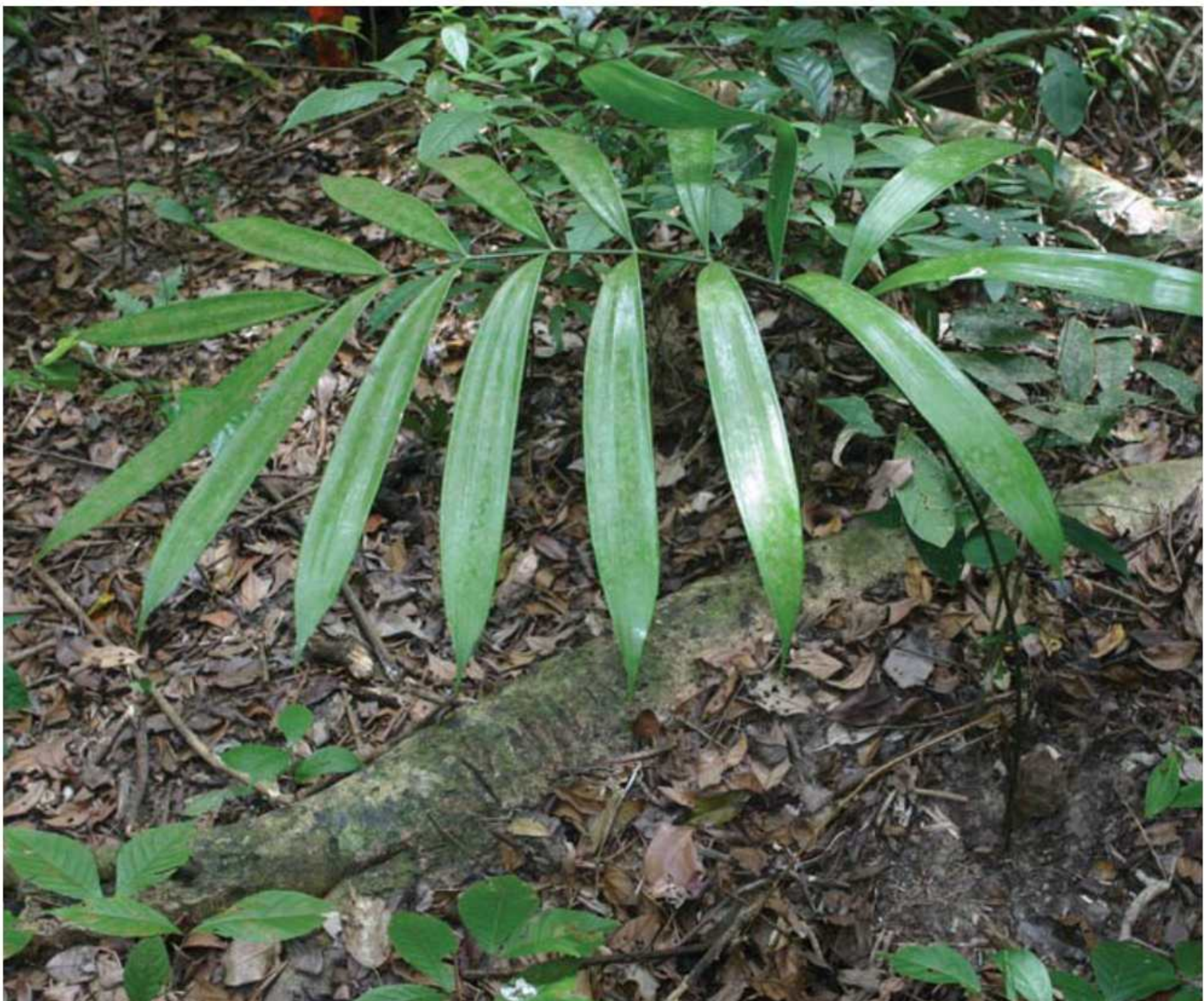
Figure 5.—: Zamia incognita in habitat.

The majority of the international cycad trade is dominated by C. revoluta . The authors sampled dense wool which characterises the stems, excised intact leaf bases from the stems, and scrutinised roots from containerised plants. All three structures were found to be infested with Aulacaspis scale on surfaces which cannot be detected even during thorough superficial visual inspection of intact plants. These concealed infestations allow C. revoluta to transport scale insects in a cryptic manner, and lends support for a policy of strict prohibition of imported C. revoluta plants from countries known to have Aulacaspis scale infestations.