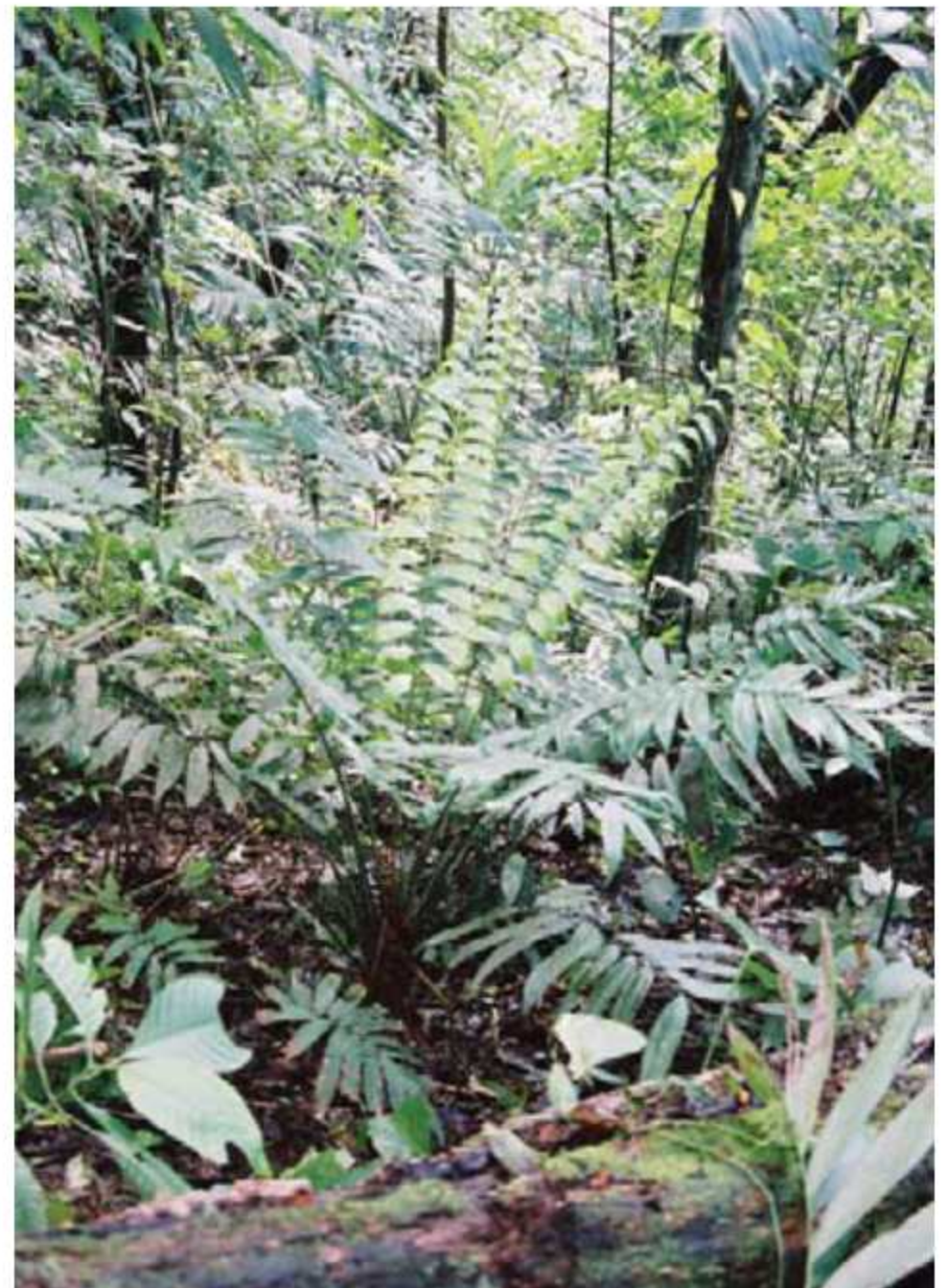
Figure 6.—: Zamia oranreysii in rainforest habitat in Honduras.

Our next quest was for an undescribed Ceratozamia . Phytogeographically this is also interesting. In neighbour-