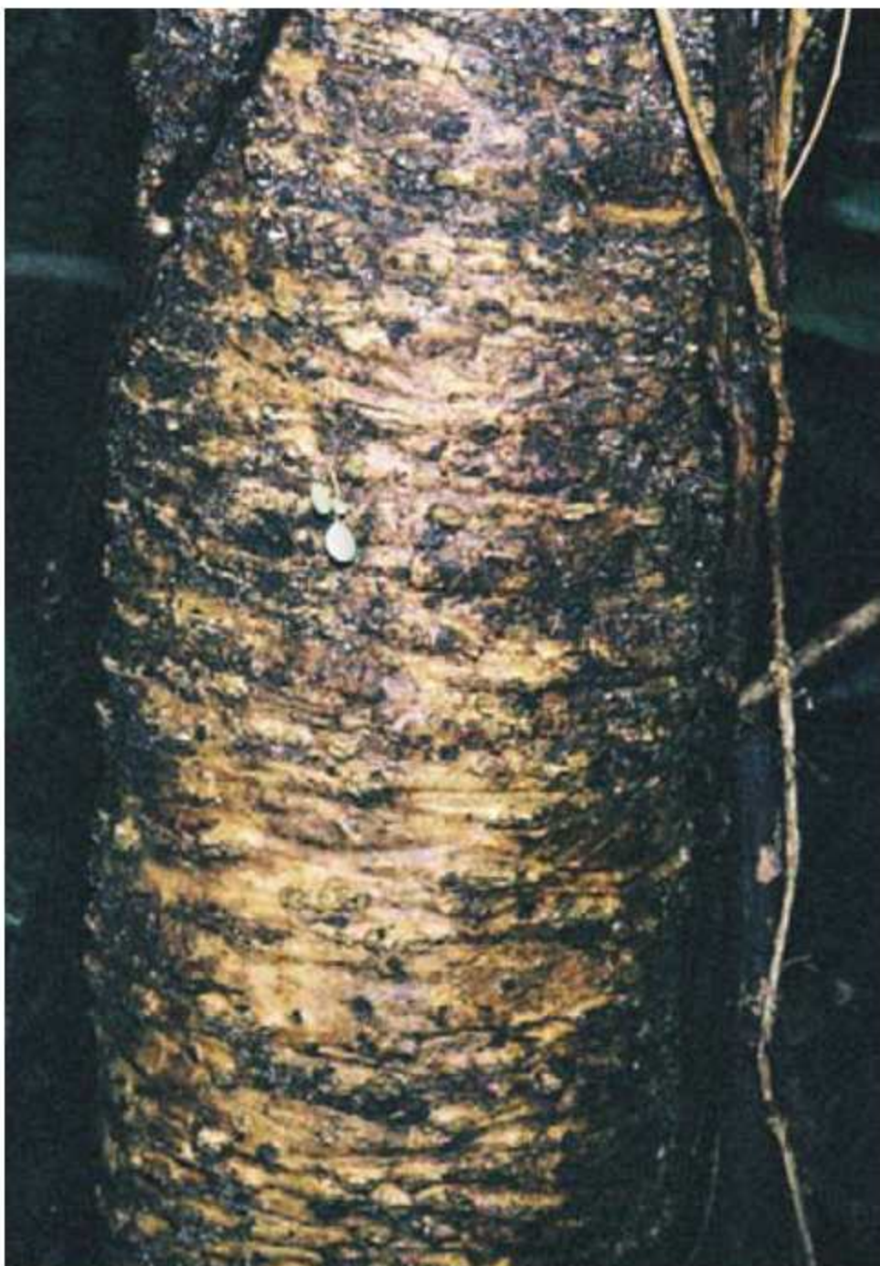
Figure 8.—: Zamia onanreysii in Honduras: the trunk, about 15 cm thick. Typical for Zamia there are no leaf base remains.