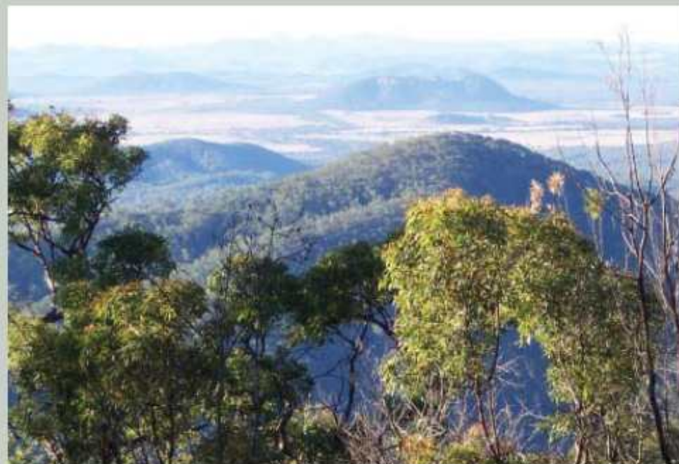
Figure 1. —: Hills and mountains of the Berserker Range, central Queensland, where Macrozamia miquelii is fairly well distributed; looking north from Mount Archer.

Taxonomic confusion followed. Mueller’s original description seems to have been based on a composite of what we now regard as M. miquelii from Rockhampton, M. macleayi from near Brisbane and, oddly, M. fawcettii from the Richmond River catchment in New South Wales. This muddled concept followed through in subsequent