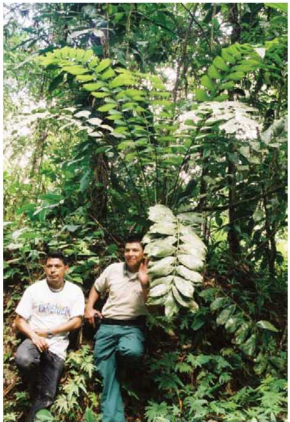
Figure 10.—: Ceratozamia hondurensis