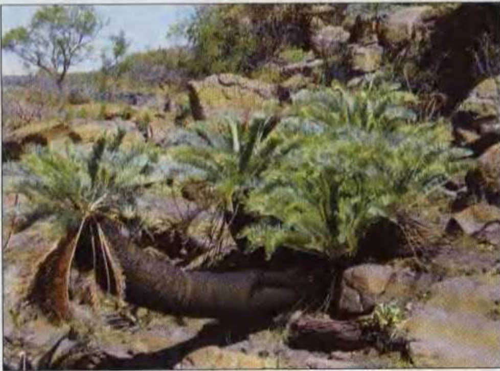
Colour Figure 3 Large clustering of specimens of E. lanatus .