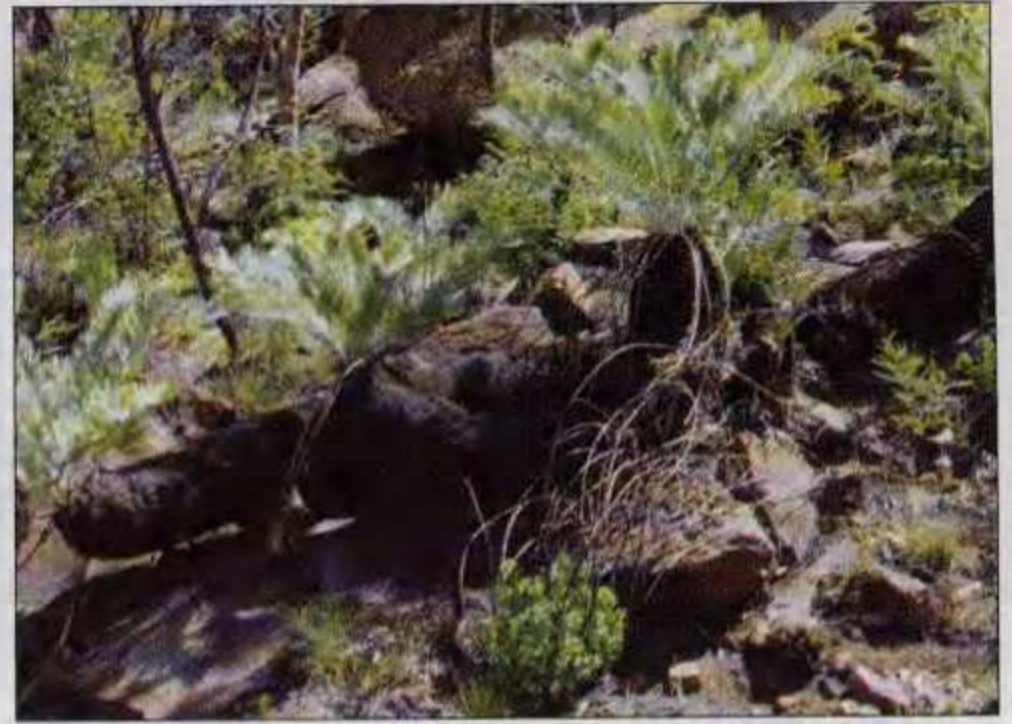
Colour Figure 4 Another cluster of E. lanatus specimens.