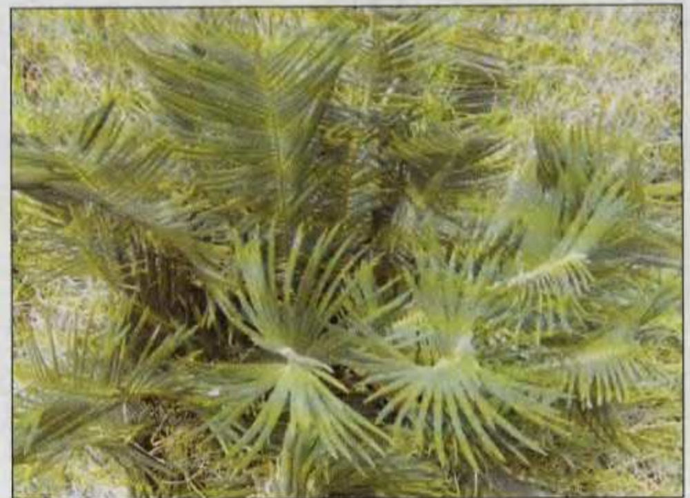
Colour Figure 9 Top view of an E. cycadifolius specimen.