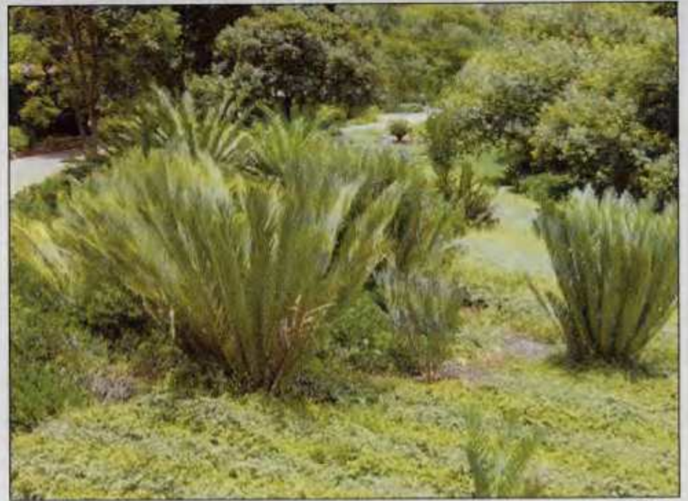
Colour Figure 7 Specimens of E. dyerianus .