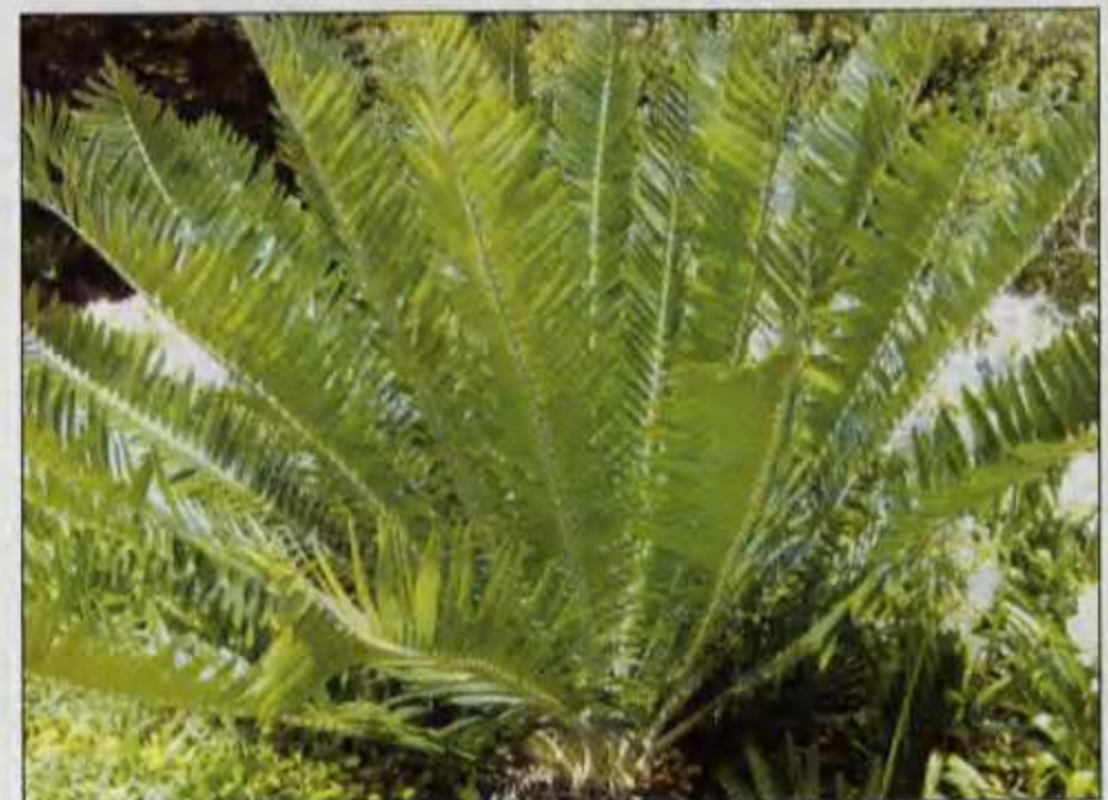
Colour Figure 10 One of the only few "exotics": E. manikensis .