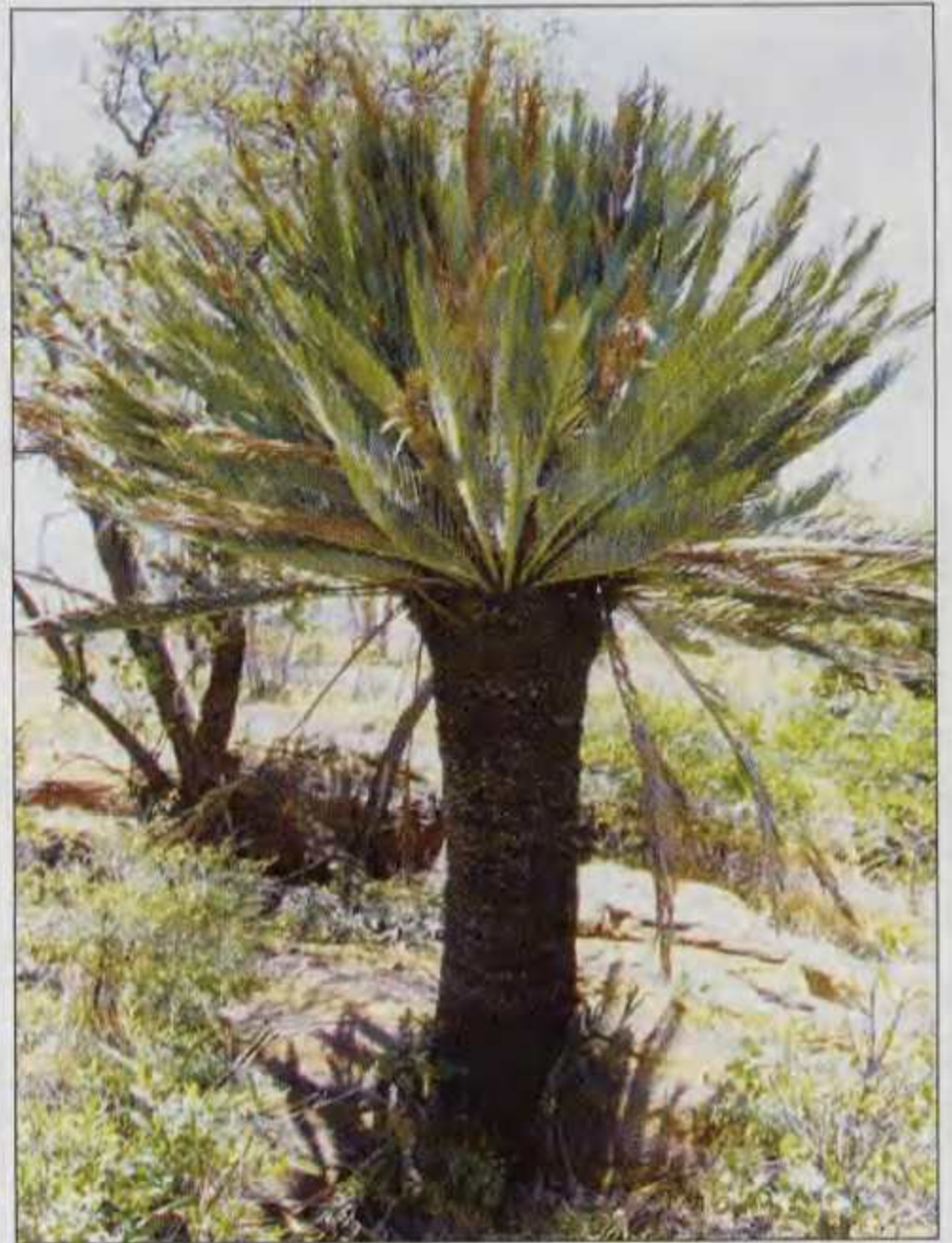
Colour Figure 5 A four-headed male E. middelburgensis .