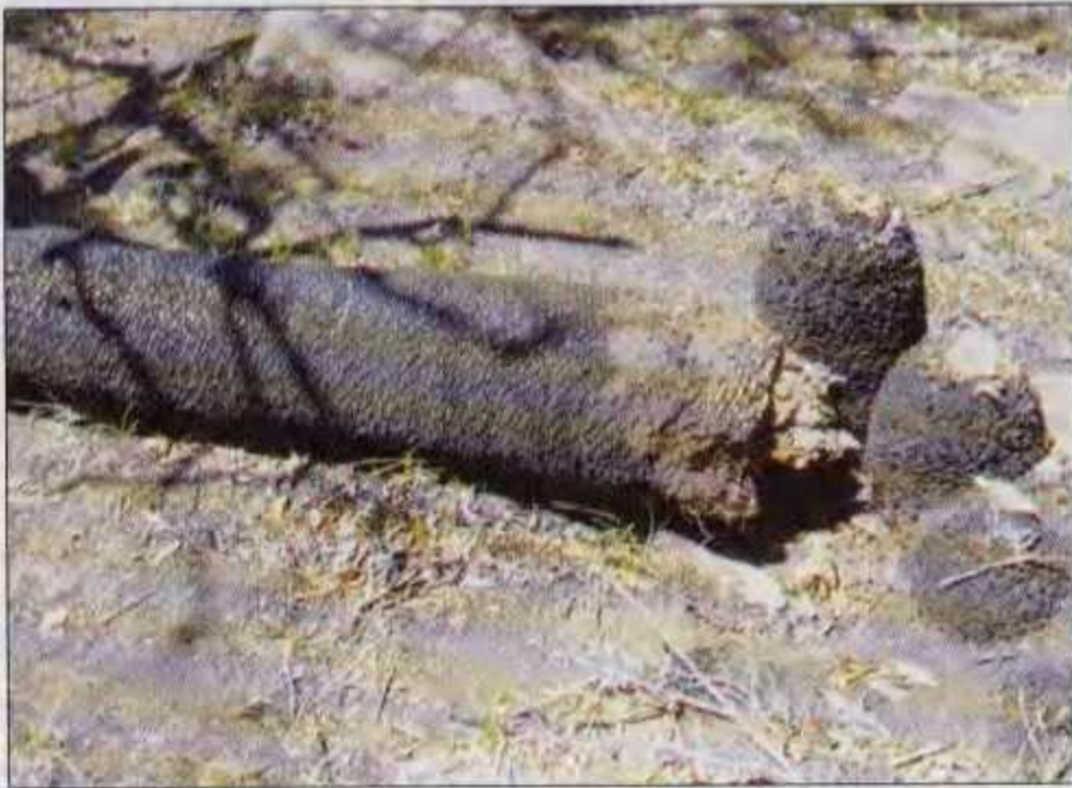
Colour Figure 2 E. lanatus ; evidence of destruction.