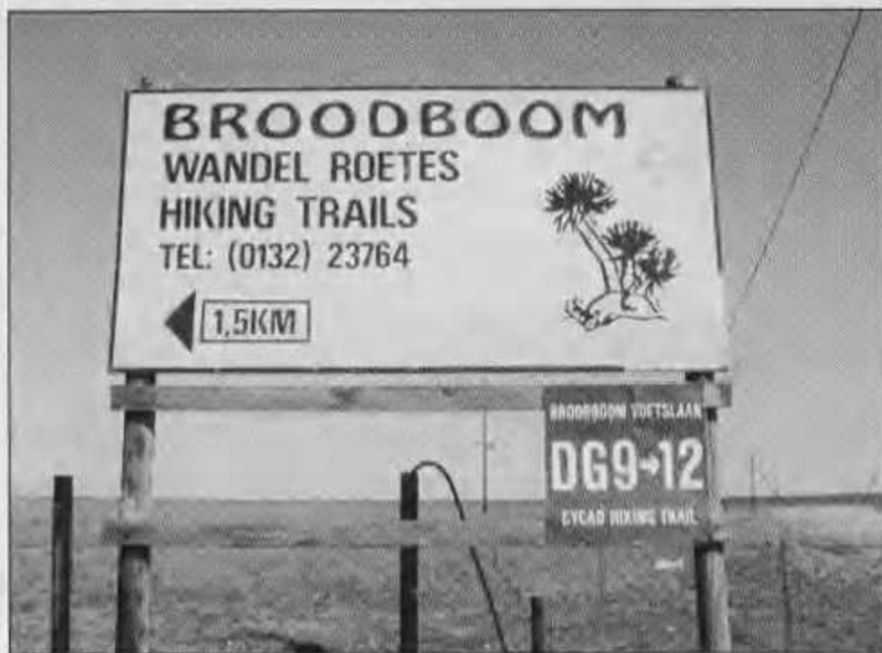
Figure 1 Cycad Hiking Trails, Middelburg, Mpumalanga.

The site is located approximately 20 km just outside Middelburg, off the N11 towards Groblersdal (see Figure 1). Accommodation is very basic and consists of a few A-frame units with four mattresses per unit. Braai facilities, fire wood, clean water and an outside bathroom/shower at the main house are provided. You need to take your own sleeping bag, food, cutlery, mosquito repellent, and lots of sun screen!!