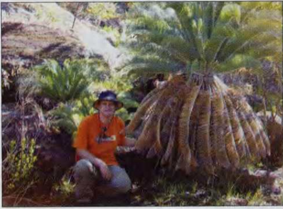
Colour Figure 1 A large specimen of Encephalartos lanatus with a very attractive skirt of older leaves; Suikerbos Hiking Trail, Middelburg, Mpumalanga.