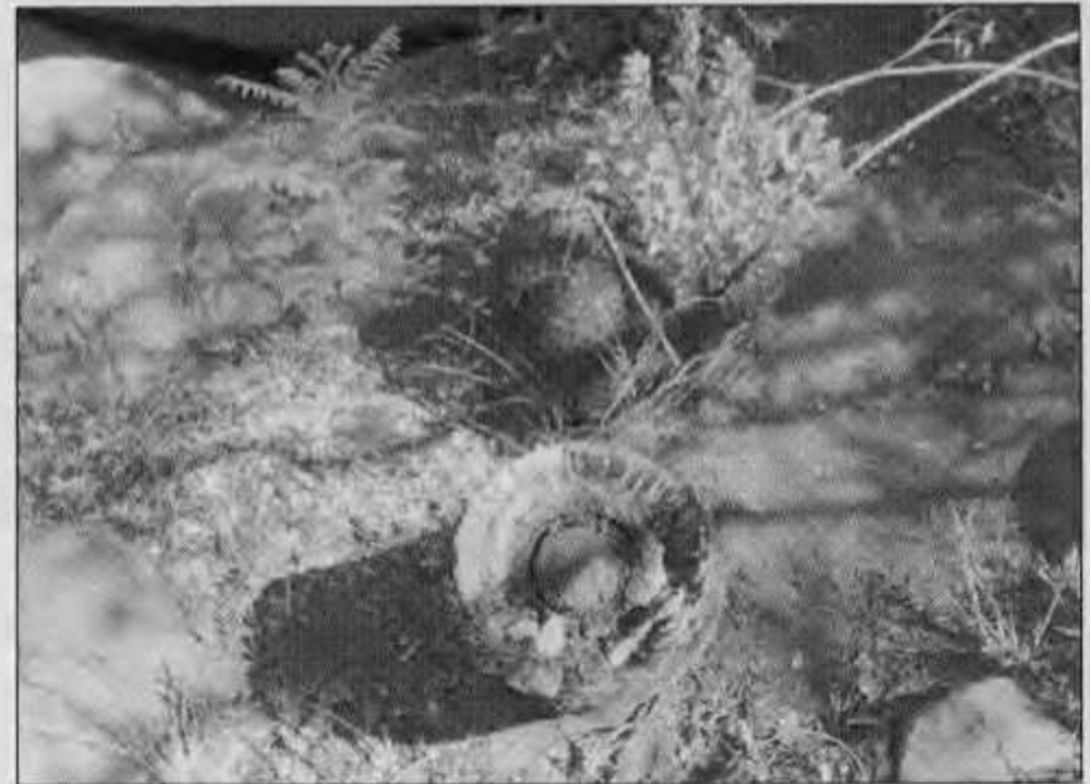
Figure 2 Encephalartos lanatus ; evidence of complete destruction by fire or other means.

There was evidence of recent veld fires with almost all the stems burnt pitch black. There was also evidence of some mature plants completely destroyed by either the veld fires or some other means which can only be left to speculation (Figure 2; Colour Figure 2 on p. 9).