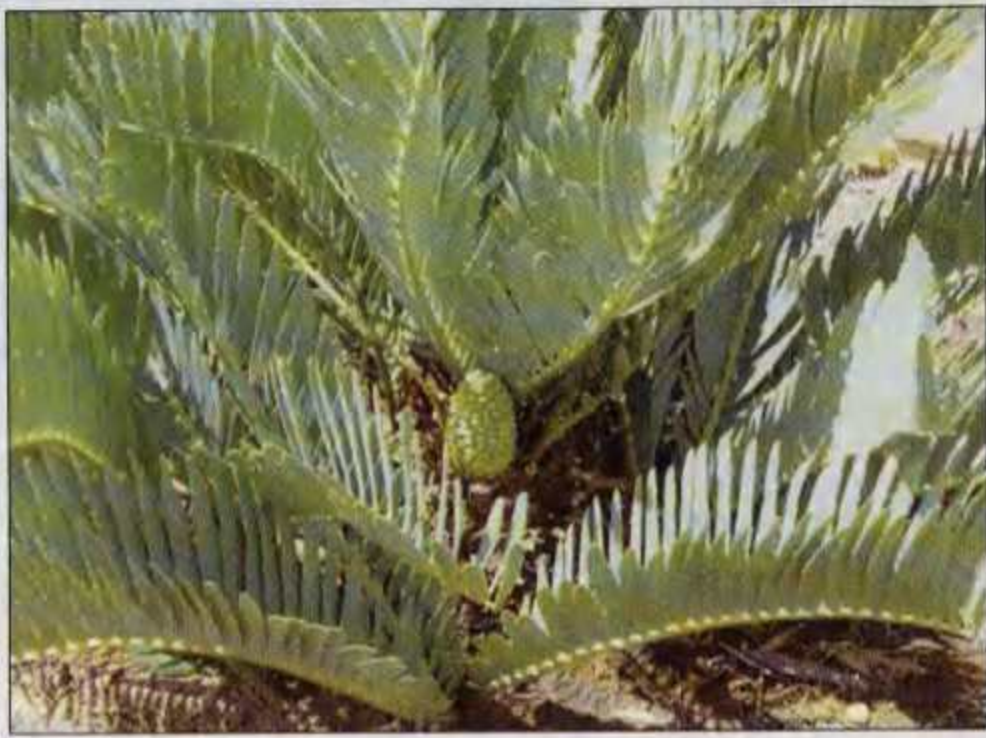
Colour Figure 6 A coning Encephalartos cupidus in the Witwatersrand National Botanical Gardens.